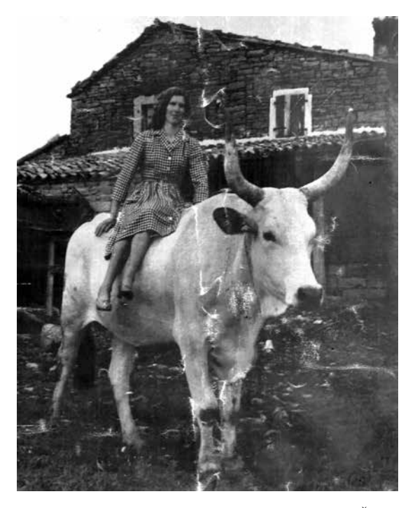
The photo displayed in the butcher shop "Graciano" in Žminj.

the younger generation, and the culture of man able to be sudden and fast-changing, results in an impressive autochthonous wealth. The increasingly dominant position of man has left the cattle overshadowed. I believe that man will save Istrian cattle because there are a number of interested individuals and a growing number of reasons for their preservation. However, cultural zoology, with its knowledge on the mutual influence of man and animal, must also be heard to side with the animal. A great number of scientists and experts are dealing with the problem of the domestication of animals. One of the possible divisions is to "utilitarian" animals kept outside human dwellings, with no emotional relations, and "pets" which live with man, are communicated