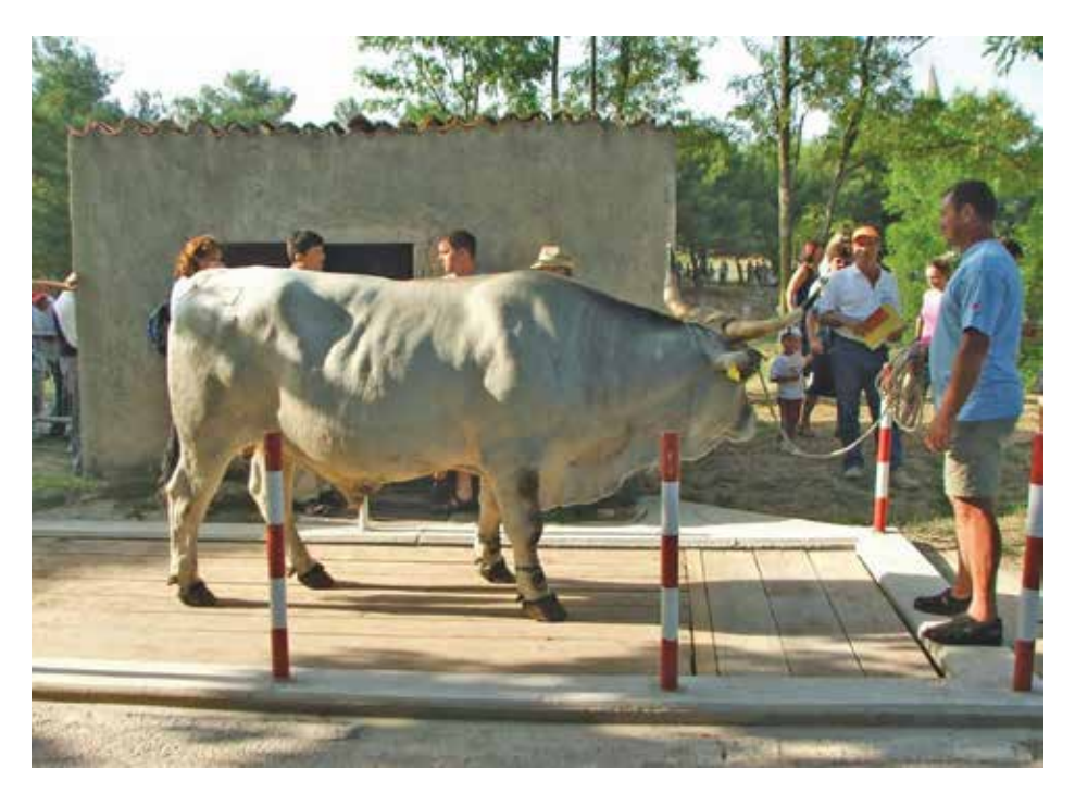
Boškarin - from a peasant worker to a showpiece Jakovlja, Kanfanar, 2005.