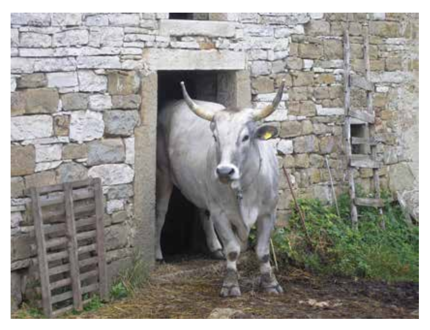
Boškarin in Bužleti, 2007 (photo by Ivona Orlić).

The wish to preserve the autochthonous breed of Istrian cattle, due to a sharp drop of its numbers and the danger of its extinction, has brought about a string of deliberations and activities in order to modernize and conceive the further life course of the boškarin . Whilst the process of extinction has been stopped, the link with human culture, which brought it to the edge of existence and then raised it up again, remains vague. Furthermore, the considerations regarding Istrian cattle in the everyday Istrian life brought about the problems regarding terminology. The present and future interactions of man and boškarin , inevitably relying on traditional moments, are the topic of this article.