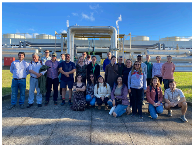
Fig. 6. Visit to the Pico Vermelho powerplant's installations (São Miguel Island).

on the Ribeira Grande geothermal field, which, together with the Ribeira Grande Geothermal plant, provides around 44 % of the electricity needs of São Miguel Island, 23 Mwe net. The field is located in the northern flank of Fogo Volcano, the largest among the three dormant stratovolcanoes of the island, characterized as a 245 °C two-phase reservoir hosted in volcanic rocks intersected by 1 to 1.5 km deep wells. A guided visit through the installations was made (Fig. 6) and the operation team explained the details of the exploitation system, both advantages and challenges presented along the history of the plant. Currently, the operation runs five producing and three reinjecting wells, working with a fluid at 161 °C and 5 bar, with an installed production capacity of 10 MW with a binary ORC plant. Residual heat from the operation is not used for any other application, although the 90 °C reinjection temperatures could represent an interesting opportunity for low to intermediate enthalpy geothermal applications.