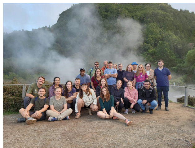
Fig. 7. Visit to the Furnas volcano's fumaroles in Terra Nostra park.

place since the island was settled in the mid-fifteenth century, and where several craters, domes, maars, and pumice cones can be observed. The group then headed to the Terra Nostra park, located next to the Furnas Lake and inside the ancient caldera, where fumarole fields and hot springs can be seen (Fig. 7). A local dish is prepared here by burying a hot pot in the ground to let the high temperature fluids cook the meat and vegetables at temperatures from 66 °C to 93°, for 6 to 8 hours. There are also thermal baths, which are characterized by temperatures around 40°C, and high iron content.