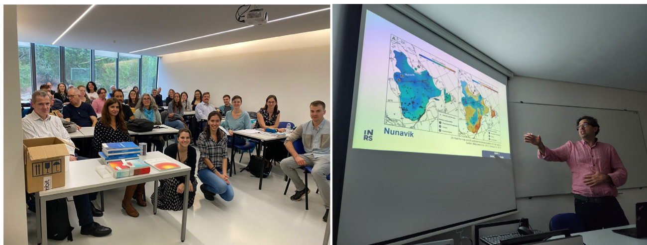
Fig. 4. Annual meeting at University of Coimbra.

São Pedro do Sul Hydromineral and Geothermal Field consists of two main zones: the Termas and Vau poles, both within the junction of São Pedro do Sul-Ribamá Fault, Termas Fault, and Fataunços Fault, in highly fractured granite and metasedimentary aquifers, and separated by approximately 1.2 km (Almeida et al., 2022). As a place of great interest for its hydrothermal activity, the group arrived at Rainha D. Amélia thermal bath where they had the opportunity