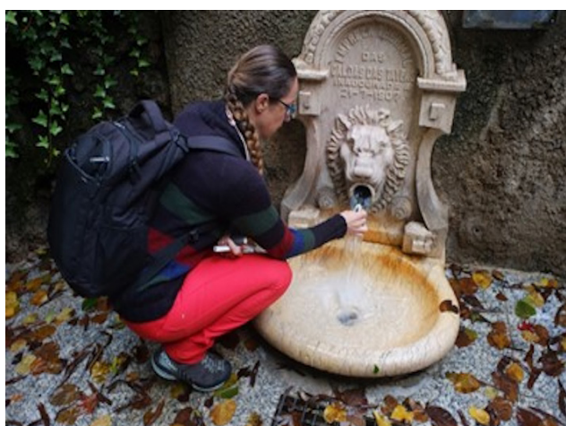
Fig. 5. Temperature measurement at a thermal water outlet in the Taipas Thermal baths.

The visit of Guimarães started at the Laboratório da Paisagem, where sustainability projects are proposed to promote and innovate in environmental and territorial practices, and where the group got to see first-hand many projects implemented in the city. Later, a trip to the Taipas Thermal thermal baths was made to learn more about the local hydrogeological conditions and how the heat has been used since Roman times for balneotherapy. Within mostly granitic lithology, the hydrothermal waters are weakly mineralized and with low temperatures of around 32 °C (Fig. 5), where the exploitation well for the thermal baths was drilled on a fault and to a depth of less than 200 m, to get better temperatures and a pumping rate of 7.3 l/s. The afternoon consisted in a guided tour around the city's historical center to learn more about the importance of the city in Portugal's national history as a republic, followed by a visit to the Gymnastics Academy, where the coupled use of low-enthalpy groundwater, surface water, air, photovoltaic, thermal and passive solar, and adequate