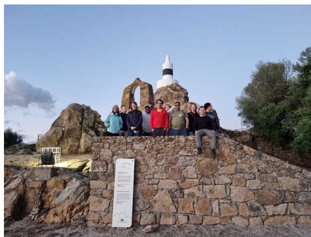
Fig. 3. Group picture in front of the Alter Pedroso castle.

To finish the day, a trip was done to the Alter Pedroso castle (Fig. 3) to learn about the 120 history of the Alentejo region and its importance in the Portuguese restoration war.