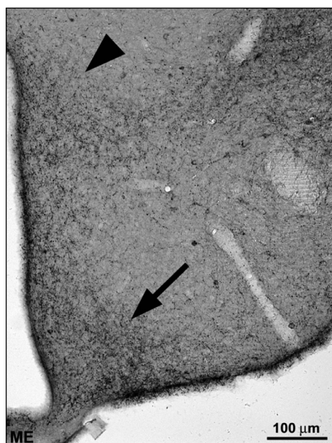
Figure 2. Immunocytochemical staining for neuropeptide Y in the arcuate (arrow) and paraventricular (arrowhead) nucleus (ME – median eminence). Immunocytochemistry was performed on 80 \mu\text{m} thick floating sections of paraformaldehyde fixed mouse brain using specific antibodies against neuropeptide Y and biotinstreptavidin labelling.

as several studies reported that peripheral administration of PP inhibits feeding behaviour while central administration increases appetite and it is not yet known what, if any, are exact roles of this peptide in the brain. 51, 58, 59