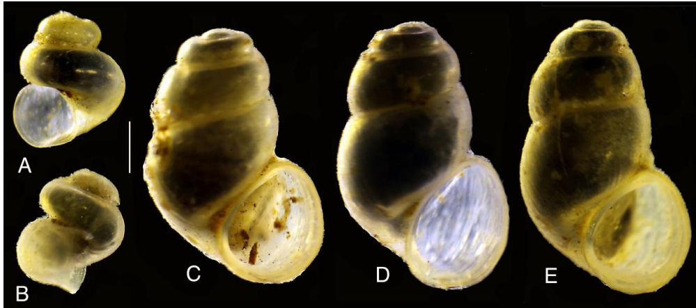
Figure 2. Shells of Bythinella cf. schmidti from the spring above the Matizovec farm (Podljubelj): A–B - sinistral specimen, C–E - "normal", dextral specimens; a bar equals 0.5 mm (photo: A. Falniowski).

Slika 2. Polžki vrste Bythinella cf. schmidti iz izvira nad kmetijo Matizovec (Podljubelj): A–B – levosučni ošebek, C–E – "normalni" desnosiučni ošebki; merilce meri 0.5 mm (foto: A. Falniowski).