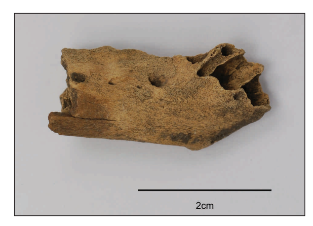
Fig. 2. Late Neolithic dog mandible from the Nagabaka site, Miyako Island.

As noted above, the archaeological record offers no evidence for the movement of people or artefacts across the gap between Okinawa and Miyako Islands, and it is widely assumed that this marks the boundary between two different cultural zones (Kokubu 1972). At present, the precise origin of the prehistoric cultures of the southern Ryukyus is unknown and we cannot completely rule out the possibility that they derived from a stray voyage by people of the Ryukyu Jomon culture. Given the geographical proximity of the southern Ryukyus to Taiwan and Southeast Asia, however, an origin in the latter regions is much more probable. The fact that the Early Neolithic of the southern Ryukyus began at around the same time as Neolithic populations started to expand from Taiwan also supports this interpretation.