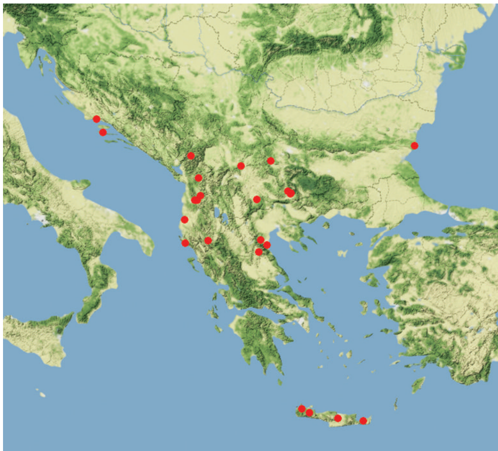
Fig. 7. The present known distribution of M. tineoides in the Balkan Peninsula. Orig. D. Devetak.

In Demir Kapija, North Macedonia M. tineoides occurred in dry rocky grasslands, pseudomaquis and transition from dry rocky grasslands with sporadic shrubs to pseudomaquis, i.e. mixed sclerophyllous evergreen and deciduous shrub thickets consisting of Mediterranean and sub-Mediterranean xerophilic shrubs and small trees (in Demir Kapija: Fraxinus ornus L., Juniperus excelsa M. Bieb., Juniperus oxycedrus L., Palmyris spina-christi Mill., Pistacia terebinthus L., Phillyrea latifolia L., and Quercus pubescens Willd.) (Fig. 6).