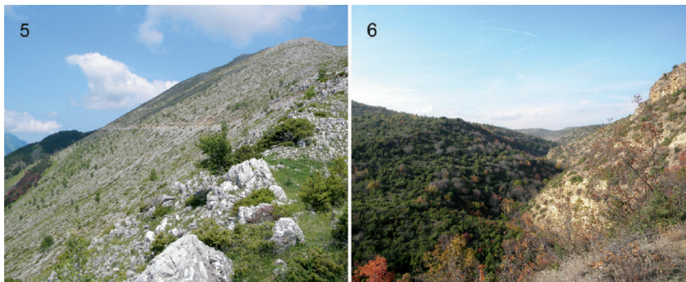
Fig. 5. Dry rocky grasslands with sporadic shrubs, Mt. Mali me Gropë, Albania.

In Mt. Mali me Gropë, Albania the male was collected on the southern slopes of the mountain, characterized by dry rocky grasslands with sporadic shrubs and screes, limestone (Fig. 5). In Mt. Thanës, Albania M. tineoides was collected on dry rocky grasslands on serpentinites. Near Ardenica, Albania it was collected in maquis. In Mt. Munellë, Albania its habitat was mountain grasslands on limestone.