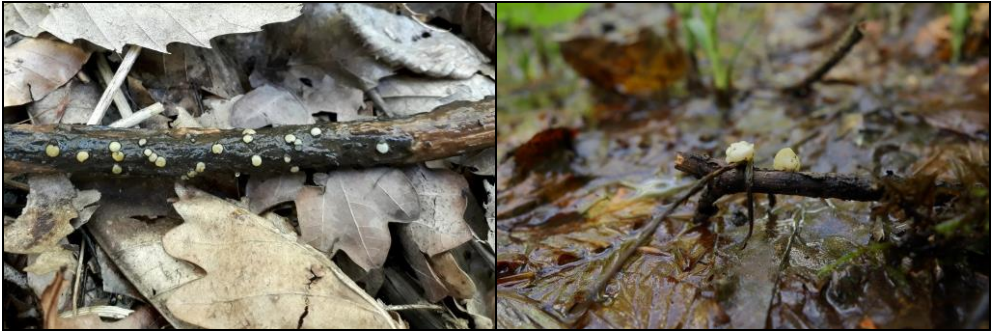
Figure 2. Two new fungi species for Slovenia, photographed at the sites within Tivoli, Rožnik and Šišenski hrib Landscape Park in 2019. Left: Vibrissea filisporia on a fallen branch at Mostec; right: Cudoniella tenuispora on a hardwood fallen branch at Mali Rožnik.

Slika 2. Dve vrsti gliv, novi za Slovenijo, fotografirani na rastišču v Krajinskem parku Tivoli, Rožnik in Šišenski hrib v letu 2019. Levo: Vibrissea filisporia na padli veji v Mostecu; desno: Cudoniella tenuispora na padli veji v Malem Rožniku.