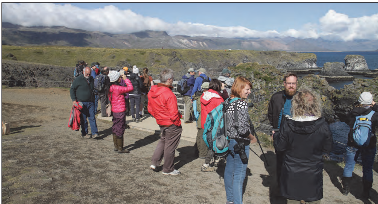
Sl. 1: Udeleženci srečanja so imeli priložnost spoznati posebnosti islandske biodiverzitete.