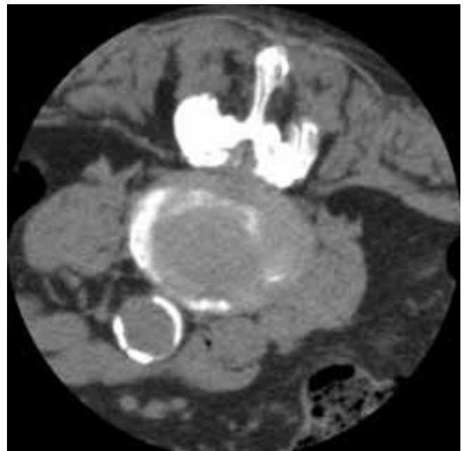
Figure 4. Preoperative CT revealed severe osseous stenosis at the level L3-L4.

An 80-year old woman in good physical condition presented with severe, sharp pain that radiated down the left lower extremity, and numbness in both lower extremities from the knees down to the lateral aspect of both feet. Paresis of the left foot and urinary retention ensued. Neurological examination revealed weakened knee extension and dorsal foot flexion on the left side, and knee jerk was reduced on the left. There was also decreased sensation over the L4 to S1 dermatomes on the left side. The patient had urinary retention, and a urinary catheter was inserted. My-