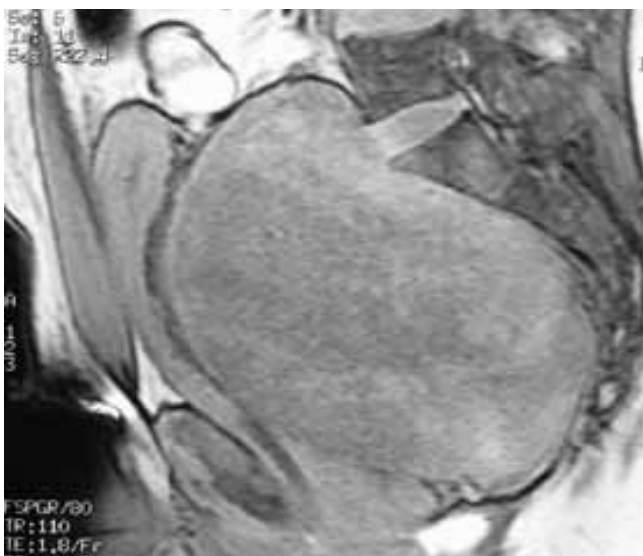
Figure 3. Abdominal T1-weighted MRI with gadolinium revealed large, presacral tumorous mass.

A 33-year old male patient was admitted to our department because of left-sided sciatica, which had lasted for 2 months. Ten days before admission, the patient experienced left foot drop. Neurological examination revealed the distribution of pain and sensory changes over the dermatome L5 on the left side, together with clear motor weakness including dorsal flexion, and plantar flexion was normal. The patient had trouble urinating and emptying the bladder, with a large residual volume. Lumbar myelography and CT were performed, which revealed a minor left-sided, lateral herniated disc at the L4-L5 level (Figure 2). Microdiscectomy at the L4-L5 level on the left side was performed, and the herniated disc was removed but proved not to be the cause of major nerve compression. After surgery, the pain in the left leg diminished slightly, although the motor weakness persisted. Additional diagnostic workup (abdominal ultrasound, CT and MRI) was performed. A large tumor (12cm in diameter) was found in the presacral