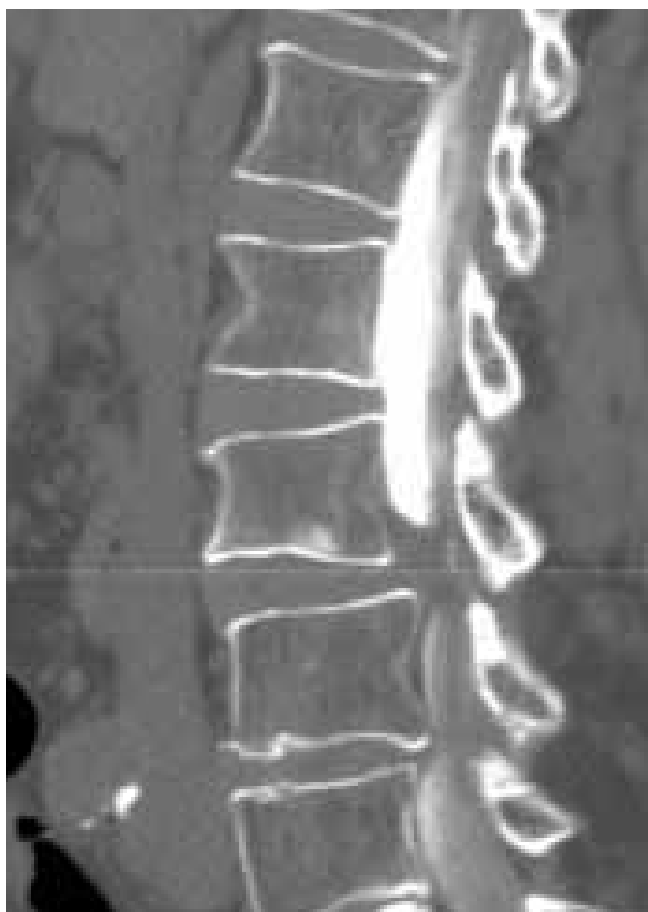
Figure 5. Myelogram (lateral view) demonstrated partial block at the level L3-L4.

elography and CT were performed, which revealed severe spinal stenosis with a partial block at the L3-L4 and L4-L5 level (Figures 4 and 5). Decompressive laminectomy and discectomy were performed at the L3-L4 level. The pain improved slightly, but the neurological deficit remained the same, and the patient became subfebrile with a slight increase in CRP. CT of the abdominal cavity revealed encapsulated fluid that had collected in the pouch of Douglas (Figure 6), which also involved the sacral plexus, which was the cause of the pain and neurological dysfunction. A puncture of the pouch of Douglas was performed, revealing pus, which was evacuated. Appropriate antibiotic treatment was introduced. After 2 weeks, the patient improved, and upon discharge did not complain of pain in the left leg; the dorsal flexion of the left foot improved, although the urinary retention persisted.