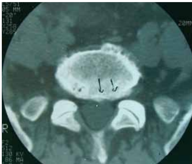
Figure 1. Preoperative CT revealed osseous stenosis of the left lateral recessus at the level L5-S1 caused by arthrosis of the facet joints and dorsal osteophytes.

A 53-year old male patient was admitted to our department because of left-sided sciatica, which lasted for several months and persisted after conservative treatment. Neurological examination revealed the distribution of pain and sensory changes over the dermatome S1 on the left side, without clear motor weakness. Lumbar myelography and CT were performed, which revealed osseous stenosis of the left lateral recessus at the L5-S1 level, as a result of arthrosis of the facet joints and dorsal osteophytes (Figure 1). Fenestration at the L5-S1 level on the left side was performed, and the involved nerve was decompressed. After surgery, the patient reported al-