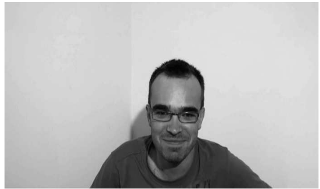
Figure 3: A sample frame from the AvID audio-video emotional database.

The second channel was captured with a Shure PG81 microphone which was positioned approximately 30 – 40 cm