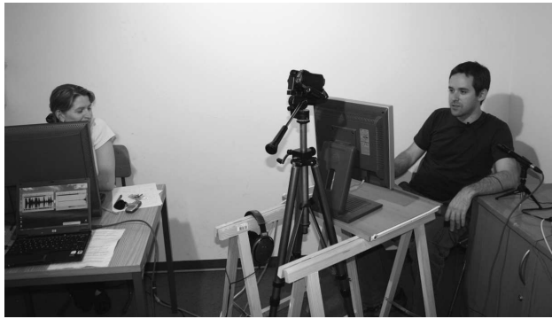
Figure 2: The recording setup.

for the video data can be found in Table 2.