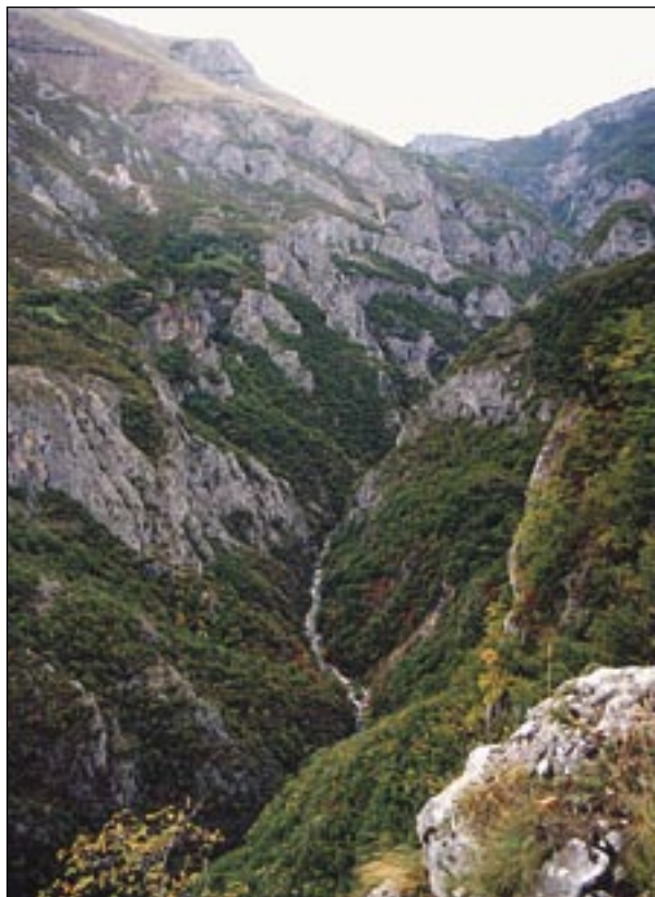
Fig.2: The Rakitnica River valley.

Occurrences of intensive destructive weathering processes are found on steeply inclined slopes of mountain ridges, as well as on escarpments of canyon sectors of valleys. In the researched part of the high Central Dinarides, various denudational processes are active (erosion, mass movements, corrosion, cryoturbation – in winter and early spring, etc.). Fluviudenudational and fluvial relief, with its erosional and accumulative forms, is developed mostly in basins lower than 800 m a.s.l. and in composite valleys of the rivers Neretva, Rakitnica, Ljuta, Jezernica, Bijela, Idbar and Trešanica. Regarding morphological evolution, the recent relief in the area south of the Neretva through gorge (from Jablanica on the west to the Sutjeska through gorge on the east) was formed during the neotectonic phase (Neogene-Quaternary) in which the relief has been uplifted to the present elevations.