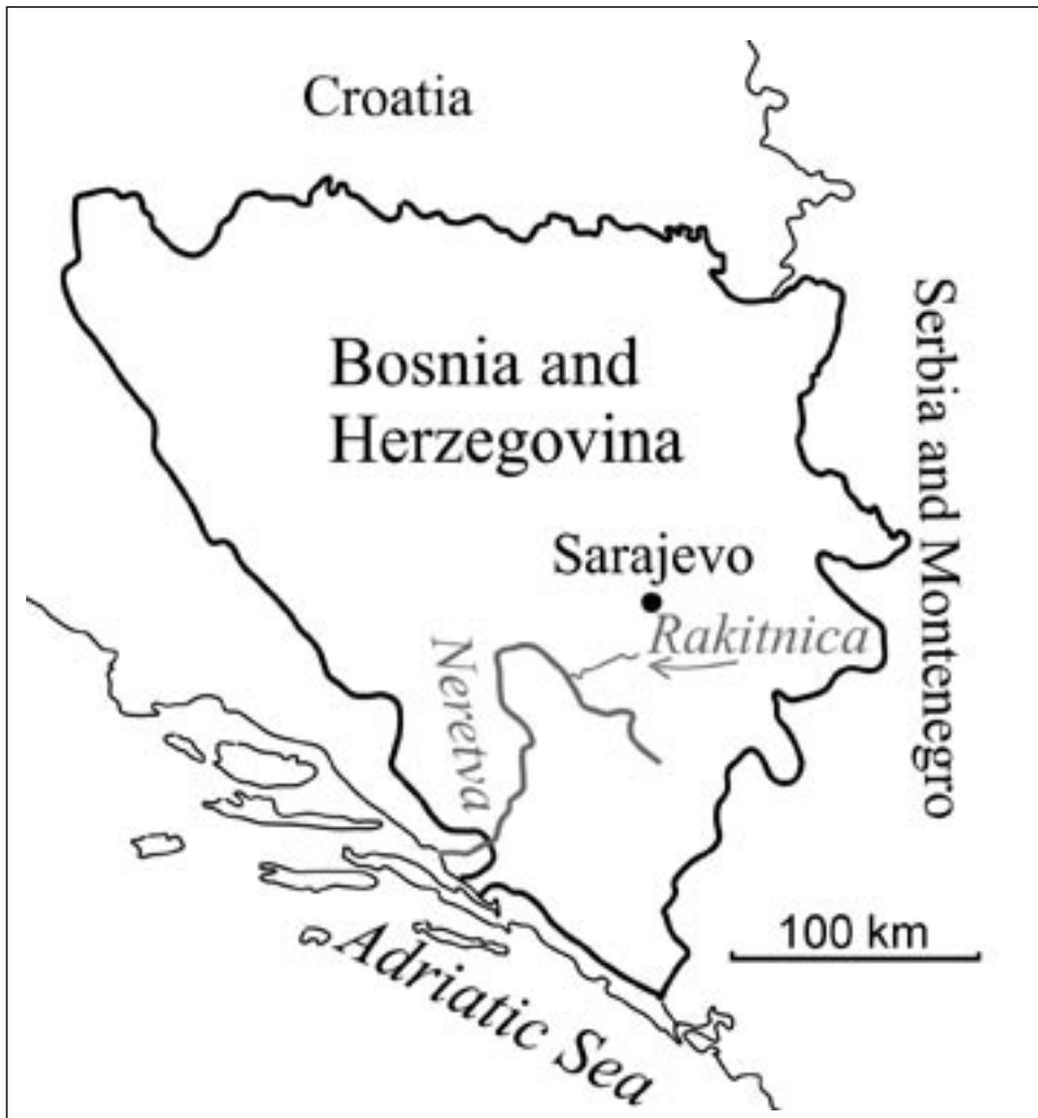
Fig.1: Geographic position of the Rakitnica River.

Dominant orientation of transversal faults is NNW–SSE. “Reverse faults with thrust structure development and napping are caused by decrease of intensity of convectional movements upward to the surface, and the collision with the Dinaric platform. Genetically, these are all morphostructures of Mesozoic-Tertiary folding with particular uplift during the Quaternary (Pleistocene)” (Bognar 1987).