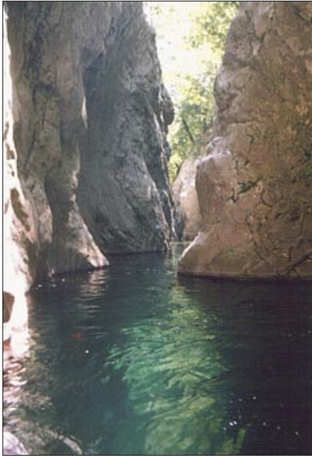
Fig.5: One of the narrowest parts of the Rakitnica canyon, in its downstream part (close to the Oštro peak).

The relation of the valley direction and the dip of strata indicates that the canyon-gorge part of the Rakitnica valley is consequent and longitudinal only in short part (in the upper section), while in most part it is an obsequent transversal through gorge, cutting the various strata at sharp angles.