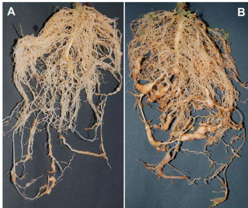
Figure 2: The reduction of nematode infection and reproduction on tomato treated with 1% NeemAzal-T/S (A) compared to an untreated control plant (B).