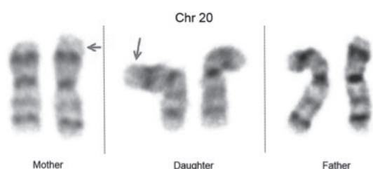
Figure 2. The comparison of mother's, daughter's and father's chromosome 20. The red arrow indicates the slightly enlarged region where the material of chromosome 17 is present.

In the second case, postnatal karyotype analysis carried out on lymphocytes was considered normal (46, XY). Furthermore, SNP array analysis (Figure 3) revealed a duplication of 14.9 Mb in the 4p16.3p15.33 regions and a deletion of 14 Mb in the 4q34.2q35.2 regions. The parents refused to be submitted to analysis.