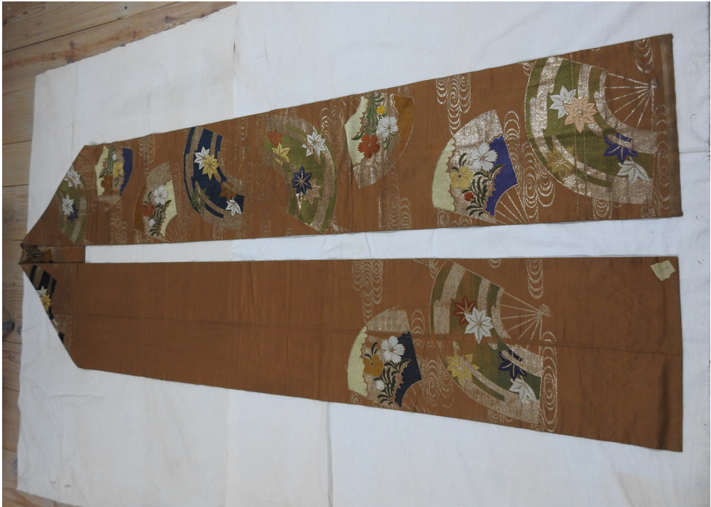
Figure 8. Obi in brown silk with embroidered patterns of fans in gold, blue, white, green and brown colours. Length 396cm, width 33cm. No. 18468.

As noted above, the kimonos and obi in this collection are now considered as vintage clothing, as they are not often made or worn today. However, these items were once worn for everyday occasions, even though the influence of Western clothing quickly spread in Meiji period. This was also a period of building a cultural identity in Japan, and kimonos played an important role as they were recognised in two key ways: as a cultural construction of what is Japanese and what is Western, and thus what is traditional and modern. This was also discussed in the framework of the “women question” addressed in the Meiji period (Goldstein-Gidoni 1999, 351). As Marija Skušek lectured and performed in a kimono, she presented a Japanese person, but also a Japanese woman. Japanese men were more encouraged to wear Western clothing for special occasions, while women wore kimonos. Even today a kimono wrapped around the female body has become a national symbol of tradition, and one that completes the image of being Japanese as opposed to being Western (ibid., 352).