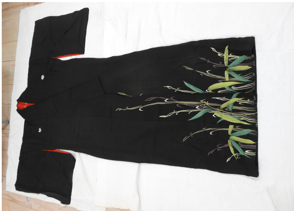
Figure 10. Black silk with green leaves on the lower part of kimono and white family crest on upper front and back side and red inner layer. Length 165cm, width 124cm; No 18461.

Japanese dance embraces and embodies Japanese culture, as it shows aspects of its aesthetic components such as the attire, with the mimetic movements drawn from Japanese culture, along with the aesthetic of the physical movements, and even the physiques of the dancers (Hahn 2007, 168). As an insider with regard to Japanese culture, Marija Tsuneko Skušek could present an “authentic” performance of the Japanese tradition outside of her country to foreigners, as she was also recognized as a promoter of cultural exchange between Japan and Slovenia. (figs. 3, 4) She used her body in public as an instrument of the art and was performing culture, where objects like the fan and kimono, along with her dancing body and music, were a form of communication with the audience and thus transmitted cultural knowledge from one country to the other. People in Yugoslavia were fascinated by the fact that the “movements in dance are fluid, graceful, acquiring aesthetic ideals that reflect the Japanese culture” ( Mariborski večernik Jutra 1935). Whether or not we consider this fascination with “exotic Japanese women” within the framework of Orientalism, the impact of her