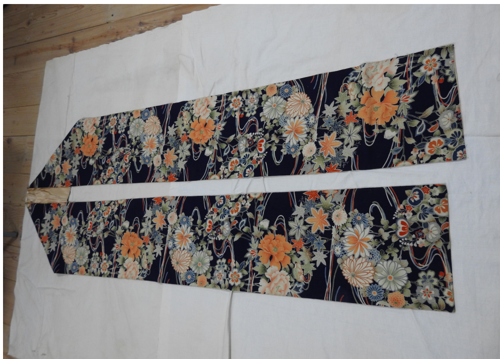
Figure 7. Obi in blue silk with embroidered patterns of flowers and waves in blue, white, red and orange colours. The other side is in beige colour without pattern. Length 374cm, wide 31cm. No 18466.

plum flowers, chrysanthemums, maple leaves and lines on one side and beige on the other side without any designs, while the second one is in brown silk (fig. 8) with embroidered fans and flowers and maple leaves, the third one in light green with painted waves and birds in blue on both sides, and the fourth obi is in brown and green brocade with gold threaded patterns of flowers on both sides. There are several types of obi as well, these are probably called chūya obi (昼夜帯, “day-and-night obi”) as they were made in the Meiji period and are not much made or worn today, with dark, sparingly decorated underside and a more colourful, decorated topside.