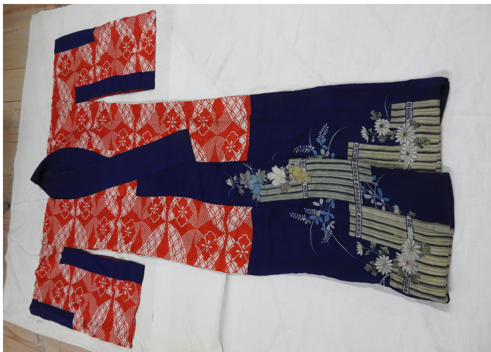
Figure 5. Kimono, dark blue silk with red patterned cloth sewed in on upper part and design of flowers on lower part. Length 155cm, wide 122 cm. No. 18462.

As mentioned earlier by Shaver (1966, 114), kimonos indicate the age and status of the wearer, as young women, whether unmarried or young wives, wear furisode (long sleeves), while married women and especially mothers wear kimonos with shortened sleeves. Similarly, the colours also indicate differences—the young wear bright colours, like red and various colours, and as women age the colours become gradually less and less vivid, finally reaching a state of grey, yellowish tan and then black in older age.