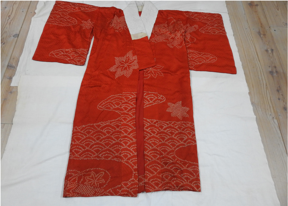
Figure 6. Undergarment, red silk with white collar, with pattern of waves and flowers. Length 133.5 cm. No 18464.

Analysing the collection of Mrs. Skušek we realised that three of the four kimonos are in dark colours (dark blue, blue or black) with some decorations (figs. 9, 10), short sleeves and are made of silk, which confirmed that these kimonos are for a mature woman. The blue one (fig. 5) has the upper part decorated with a sewed red and white pattern design, a rather odd decoration for a kimono. The lower part has a pattern of flowers and sticks on the front outside and inside. This kimono is listed in the inventory as an undergarment ( nagajuban ), but it as it does not have a white collar and it is longer than a usual undergarment. An undergarment is usually in white or light colours, but it could also be in other colours like red in this collection (see fig. 8), which might be considered today as vintage clothing. There were other kimonos that she wore according to some photos (figs. 3, 4), but there are not in museum collection.