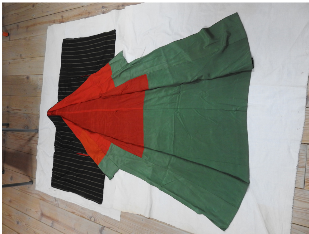
Figure 9. Kimono, black silk with grey lines, inner layer in red and green silk. Length 160 cm, up 122 cm; no. 18459.