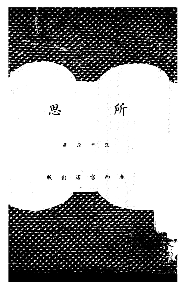
Figure 1: The title page of the 1931 publication of the book Suosi 所思 (Reflections)

dialectical-analytical method. Secondly, what Zhang further proposed was a syncretic marriage between the above-described dialectical principle on one side and scientific objectivity on the other.<sup>31</sup>