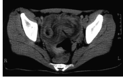
Figure 2b. Intussusception. CT scan obtained caudad to Figure 2A shows the presence of fat in the center of ileal intraluminal mass specific for inverted Meckel's diverticulum.

Laparatomy revealed an ileo-ileo-colic intusussception (70 cm long); the prevailing anomaly was invaginated Meckel's diverticulum.