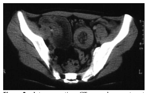
Figure 2a. Intussusception. CT scan shows a target sign in the region of the terminal ileum.

Abdominal ultrasonography revealed a soft-tissue mass with hypoechoic outer layer and central echogenic area; the peristalsis through invaginated ileum was active (Figure 1a). The characteristic US findings in a longitudinal plane were alternating hypoechoic and echogenic layers called the »sandwich« or »pseudokidney« sign (Figure 2b). Plain ab-