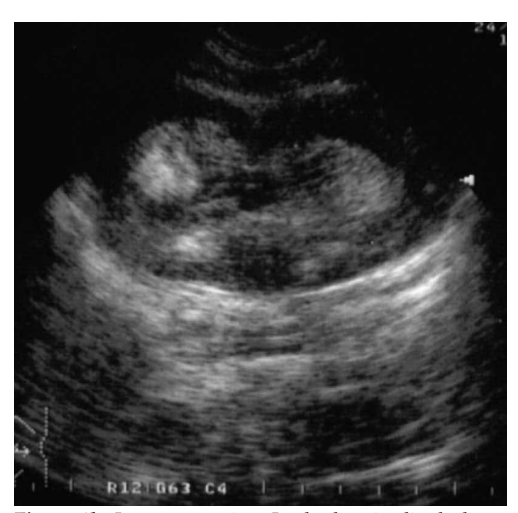
Figure 1b. Intussusception. In the longitudinal plane, the alternating hypoechoic and echogenic layers are called »sandwich« or »pseudokidney sign«.

dominal x-ray showed slightly dilated loops of the small bowel without air-fluid levels.