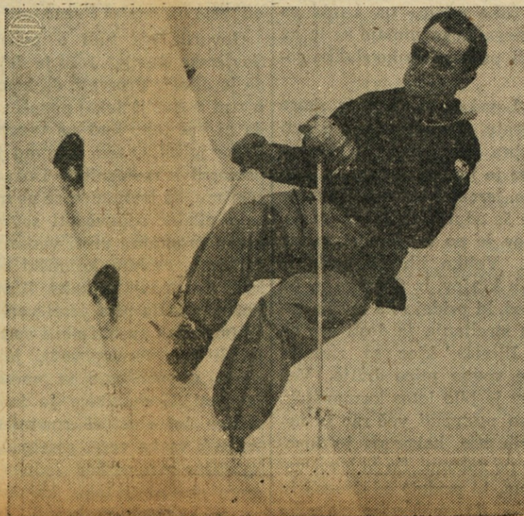
SMUČAR — Znani radijski poročevalec Lowell Thomas je tudi navdušen smučar. S tem športom se je Thomas začel ukvarjati šele pri štiridesetih letih, vendar se ga je kar dobro naučil, kot kaže slika.

Ustanovljeno 1908 Zavarovalnino vseh vrst vam točno preskrbi HAFFNER INSURANCE AGENCY 6106 ST. CLAIR AVENUE