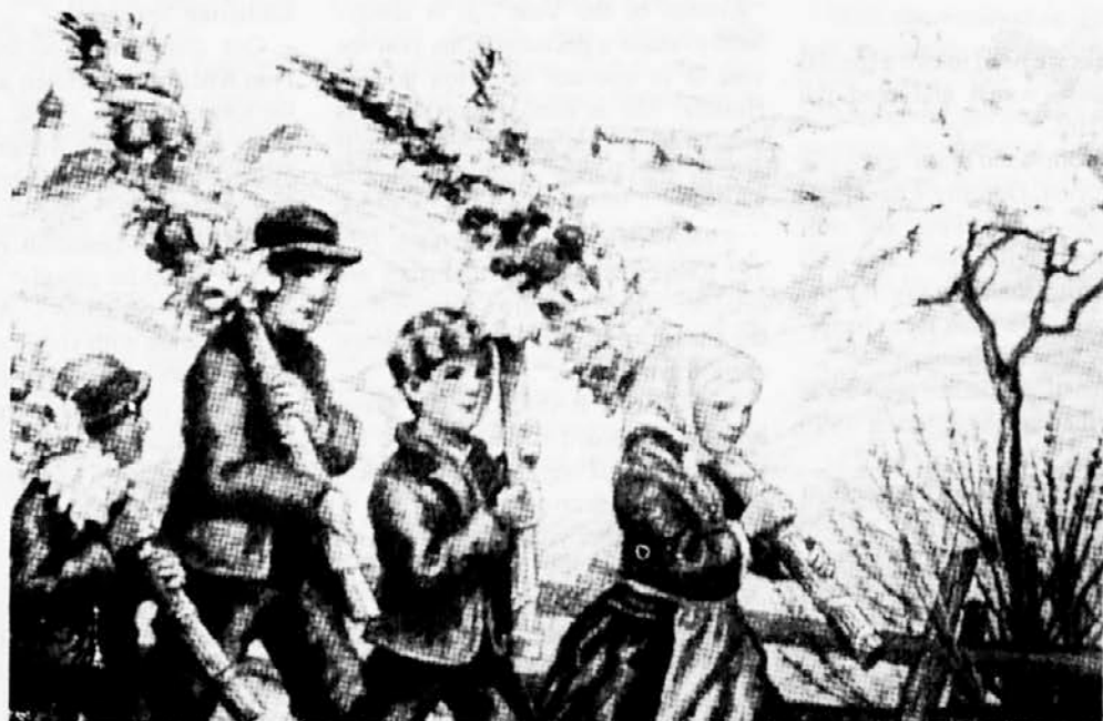
Maxim Gaspari's folk art drawing of these children in a Palm Sunday Procession, shows them carrying "Butar'ce" a traditional Slovenian bouquet made of the first greens of the spring: willow and olive branches, boxwood and pine sprigs, decorated with colorful ribbons and even fruit. This is symbolic of the re-awakening of the growing season, of spring, and the entrance of Jesus into Jerusalem when palm branches were spread before Him and of our faith that the resurrection is a new life after death.

Unused talents give you no advantage whatever over someone who has no talents at all.