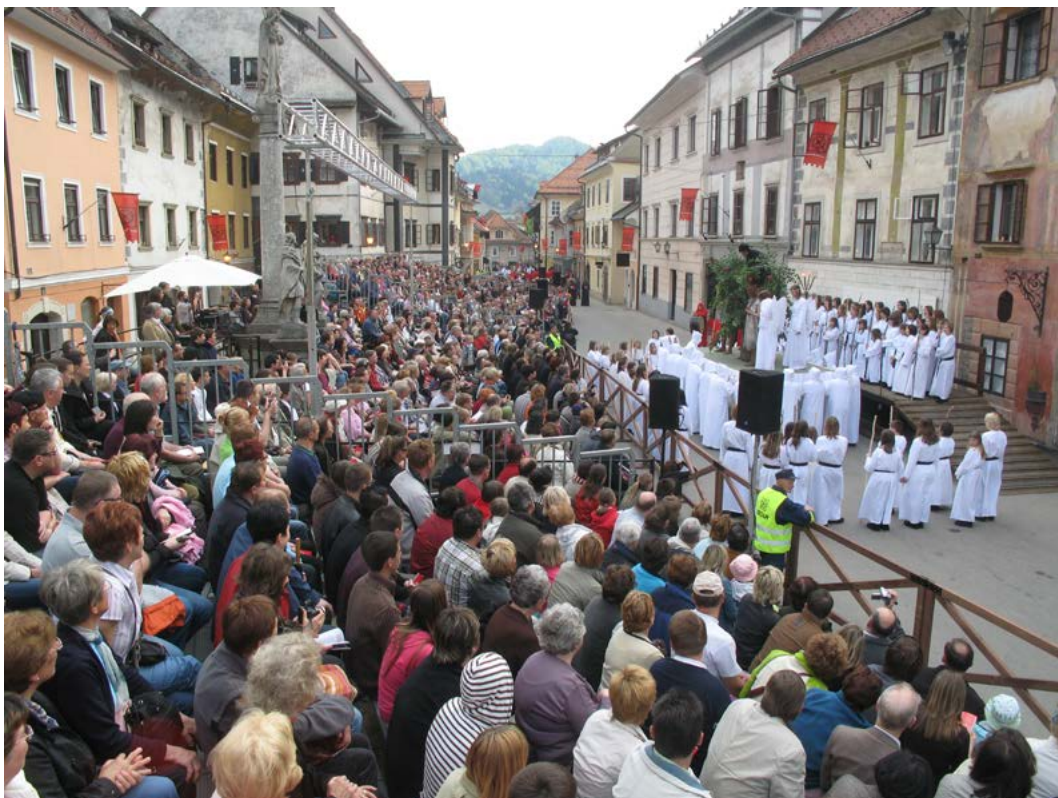
Škofjeloški pasijon. Prizor Raja na prvem prizorišču na Mestnem trgu.