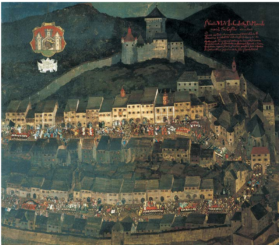
Historical depiction of the Škofja Loka Passion Play. Boris Kobe, 1967, oil on canvas. The collection of Slovenski gledališki inštitut, Ljubljana.

ŠLPP is considered the oldest extant dramatic text in Slovenian language with some additions in latin and german language and with director remarks. It is a unique testimony of the medieval – Baroque dramatisation and of the standard language of the day. The ŠLPP was initially untitled. It was only the piety which has a name – the Good Friday procession. It was this folk piety that inspired the dramatic text and its name. The name ŠLPP was written down for the first time in Koblar's edition of the Škofja Loka Passion Play facsimile in 1972. 12