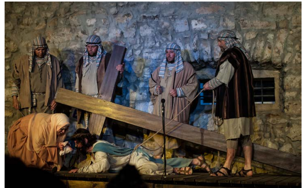
Detajl iz uprizoritve Škofjeloškega pasijona 2015.

Official representative of Škofja Loka Municipality in EuroPassion Society The Škofja Loka Museum, Grajska pot 13, 4220 Škofja Loka, Slovenija