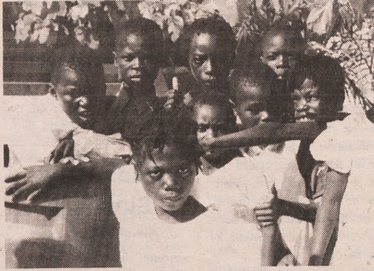
"Nekaj naših šolarjev, ki se zelo radi slikajo."

Za vsakega otroka, ki vstopi v šolo, iščemo botra, da ga podpre z $200 na leto. S tem plačamo tudi učitelje.