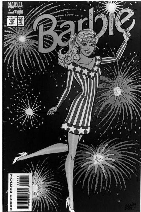
Figure 11: Independence Day's Barbie.

Eventually, I noticed that the seasonal events mentioned above were the only ones chosen for this commercialization, and I began to wonder why. One summer, the company added a U.S. flag-decorated package with red, white, and blue candies, but this was not repeated the following year. Moreover, there was no Halloween-themed package available, which surprised me, given the emphasis on candy at Halloween in the U.S. It occurred to me that the M&M'S™ sold in packages of