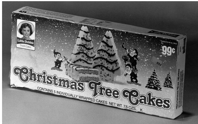
Figures 1, 2, 3: The festive year on packages – Christmas and New Year.

In the American Southwest, the custom of lighting luminarias – candles anchored in sand, which illuminate brown paper bags along walkways – is a common Latino Christmas custom. Today, luminarias are available nationwide for Christmas (red bags) and Halloween (orange bags.) This represents an attempt to turn a locally regional and ethnic custom into a national one. Americans routinely decry the ever-increasing commercialism of holiday celebrations, but in fact seem to be trapped: the ethos of convenience and consumerism has made many people unable to escape the economic aspects of celebration by accepting them as inevitable, insurmountable realities. Interestingly, the interpersonal activities customarily associated with holidays are what are remembered over the years; the objects that are most revered are those that are handmade or associated with a particular personal relationship.