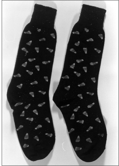
Figures 9, 10: Holiday-themed socks (Valentine's Day, New Year).

green candies with Christmas images on the packages. Early in the New Year, a version was available in red and white, with hearts and cupids, for Valentine's Day. And so on, though the year... that is, M&M'S™ "releases" holiday-themed candies on a seasonal basis. Other than the food coloring, the candies are exactly the same as those available in non-seasonally themed packages.