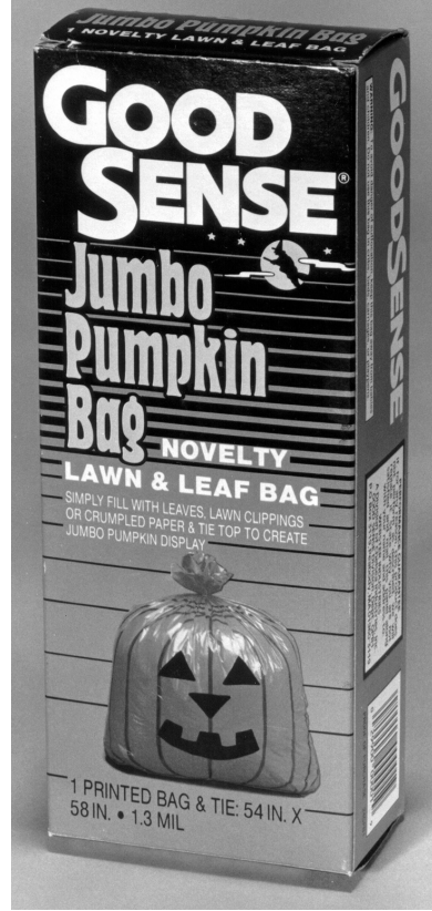
Figures 4, 5, 6: The festive year on packages – Halloween.

For instance, gift exchange is a major feature of Christmas and the year-end celebrations, traceable (at least) to ancient Rome's Saturnalia and New Year's traditions. As celebrated today, Christmas cards and gifts are exchanged (in some counties, St. Nicholas' Day, New Year's, or Three Kings' Day share this gift exchange custom). The amount of money spent on gifts is enormous.