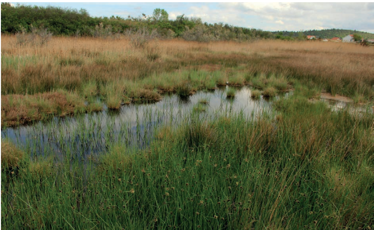
Figure 5: Ljubač – a remarkable site of salt marsh vegetation of the Dalmatian coast. Slika 5: Ljubač – pomembno rastišče slane močvirske vegetacije na dalmatinski obali.