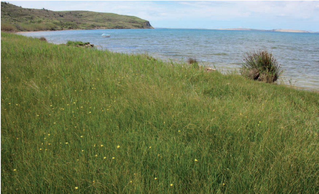
Figure 6: Rtina – a remarkable site of salt marsh vegetation of the Dalmatian coast. Rich stands of Scorzonera parviflora .

Together with Ljubač it is the most remarkable site