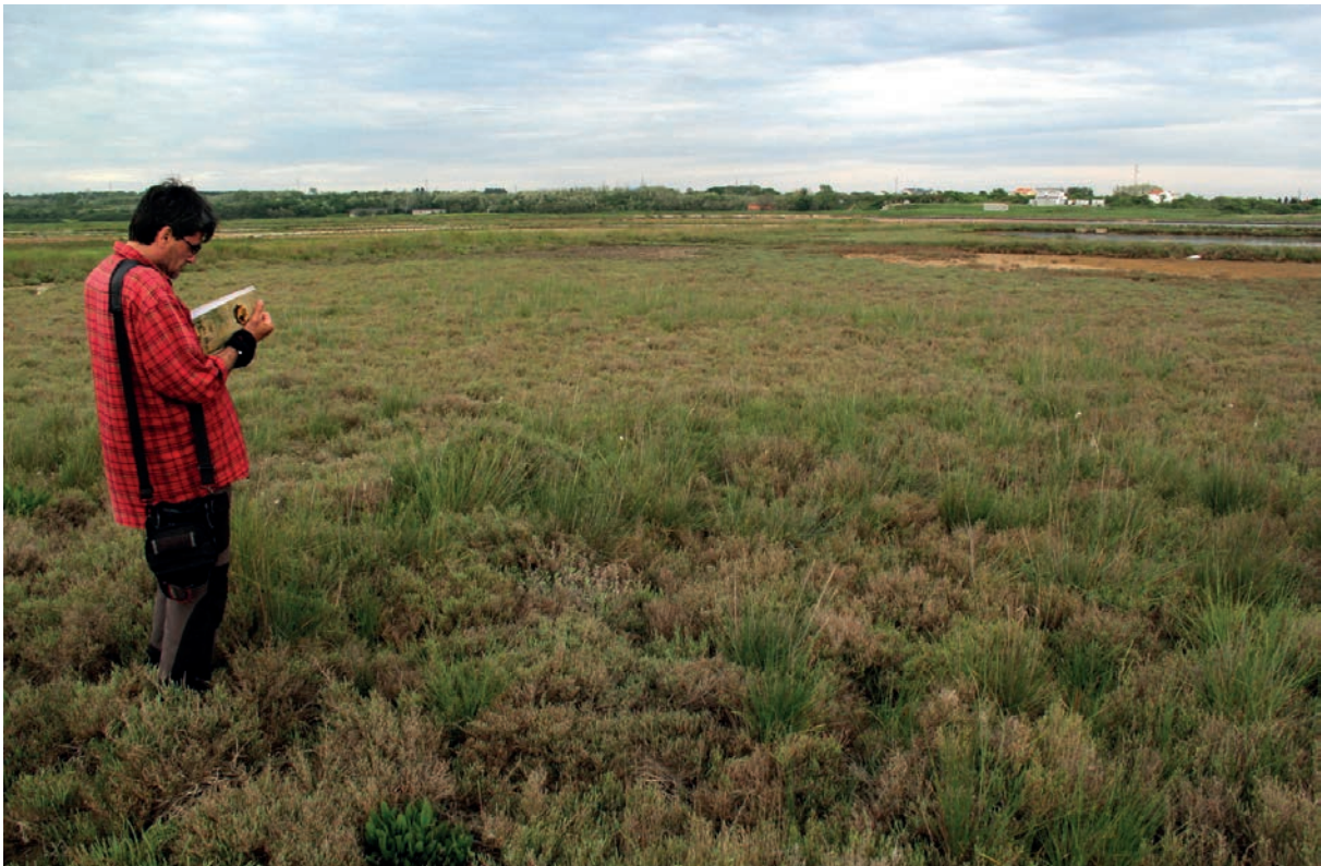
Figure 3: Salt marshes in the abandoned salt works of the Ninska solana. Slika 3: Slana mokrišča na opušćenih solinah v Ninski solani.