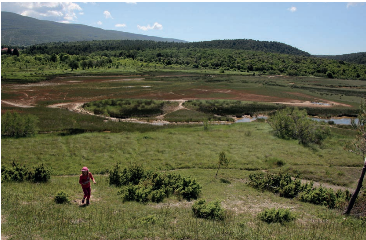
Figure 2: Salt marshes in the estuary of the Karišnica River (Karin Gornji). Slika 2: Slana mokrišča v estuariju reke Karišnice (Karin Gornji).

Artemisia caerulescens , Carex extensa , Centaureum