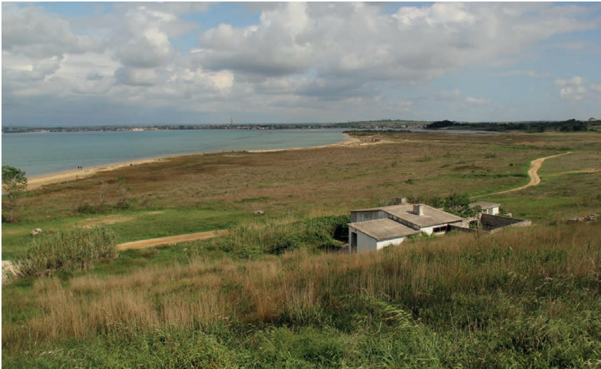
Figure 4: Ninsko blato – a remarkable site of salt marsh vegetation of the Dalmatian coast. Slika 4: Ninsko blato – pomembno rastišče slane močvirske vegetacije na dalmatinski obali.