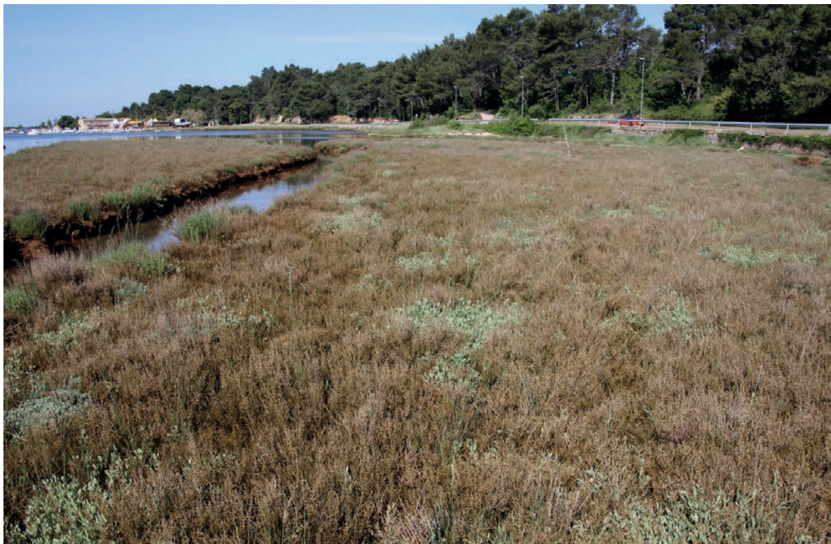
Figure 8: Salt marshes at Vabriga, Santa Marina (Istria).

Dates of visits: 30. 8. 2005, 21. 5. 2016