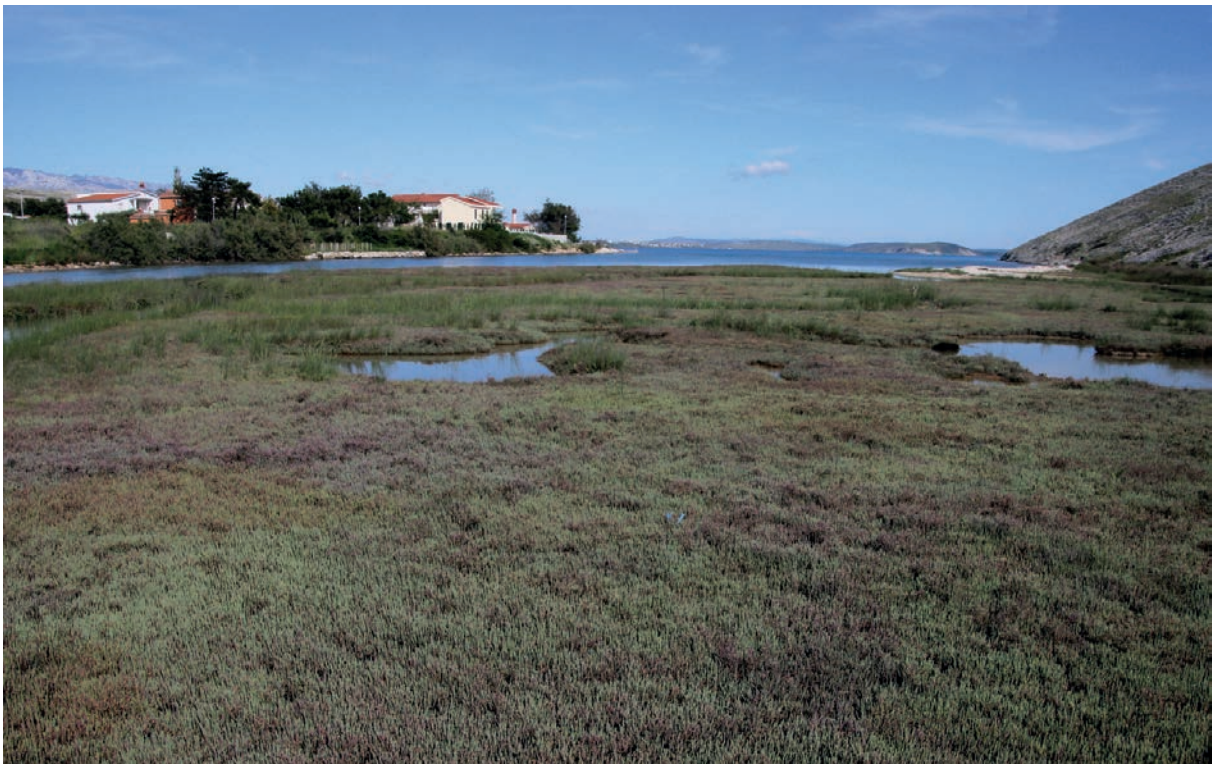
Figure 7: Vlašići – a remarkable site of salt marsh vegetation of the Dalmatian coast (Pag Island).