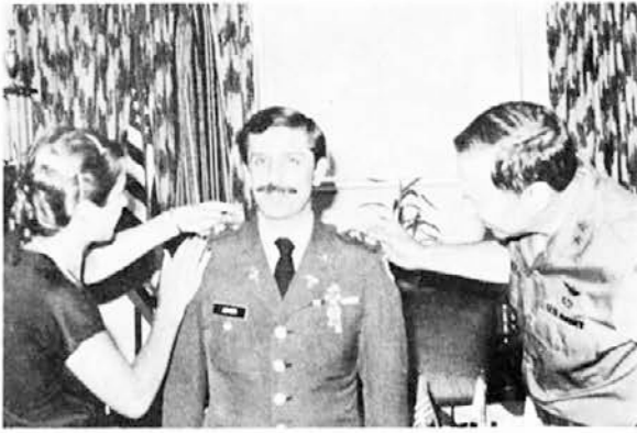
Narava se prebuje iz zimskega spanja.