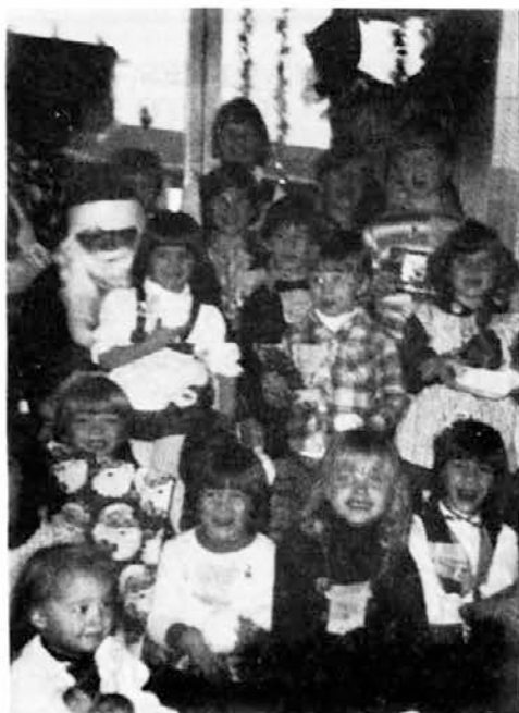
Juniors of Br. 50, Cleveland, Ohio at their yearly holiday party. Aren't they sweet?

Happy St. Patrick's Day. Meeting this month is March 13th.