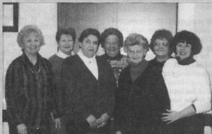
All the members of Br. 101, Bedford Hts., Ohio are honored this month at their Mother's Day celebration!