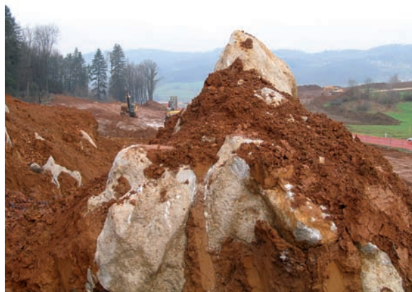
Fig. 2: Subsoil shaped pillar of stone forest.

were put upon a special grounding. For this reason we could only research the karst formations that had been shaped by water percolation through the karst surface. We did not find the characteristic subsoil karren as those discovered during the earthwork at Bič, which were also formed by the fluctuation of underground water (Knez et al. , 2004). Karst features discovered during construction