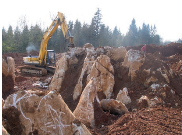
Fig. 5: Pointed tops of narrower pillars.

The subsoil stone forests are composed of a dense network of more or less thickset and pointed pillars, which reach up to 8, sometimes even 10 metres, although most are lower. The narrower pillars with a diameter of one to two metres have sharp or rounded spire (Fig. 5), while the thickest ones reaching up to ten metres (Fig. 6)