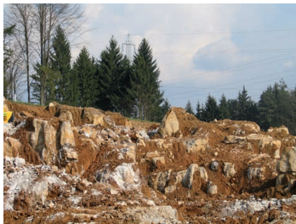
Fig. 1: Uncovering of subsoil stone forest.

Sl. 1: Razkrivanje podtalnega kamnitega gozda.