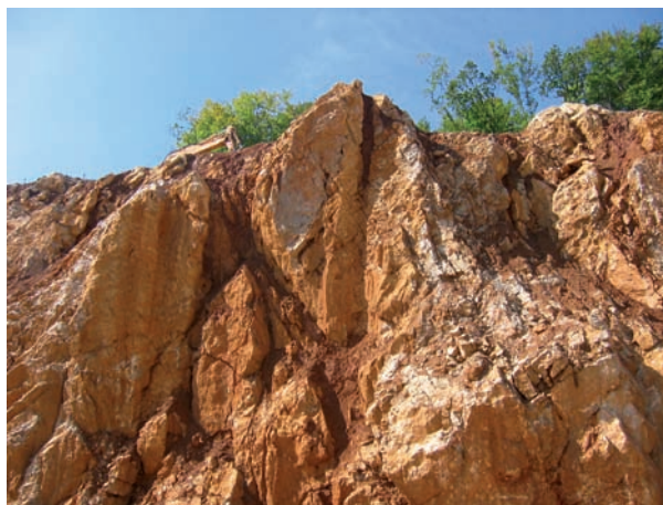
Fig. 7: Subsoil channels.