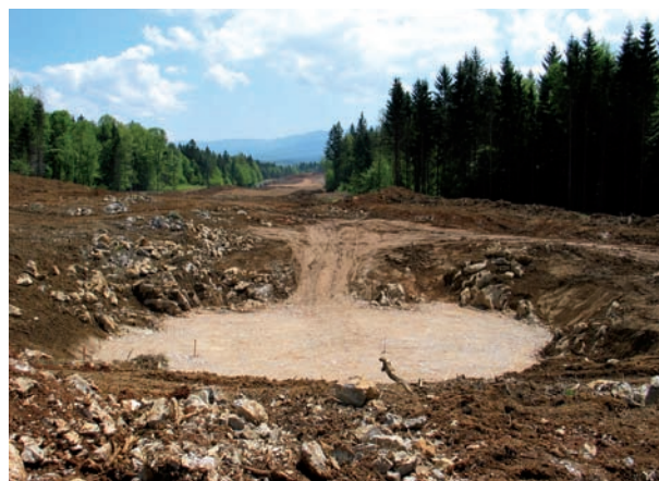
Fig. 4: Filling of dolina with gravel.

The configuration of the surface includes smaller or larger dolinas (Fig. 4). The largest have a diameter of several tens of metres. Some are filled with grey clay, the