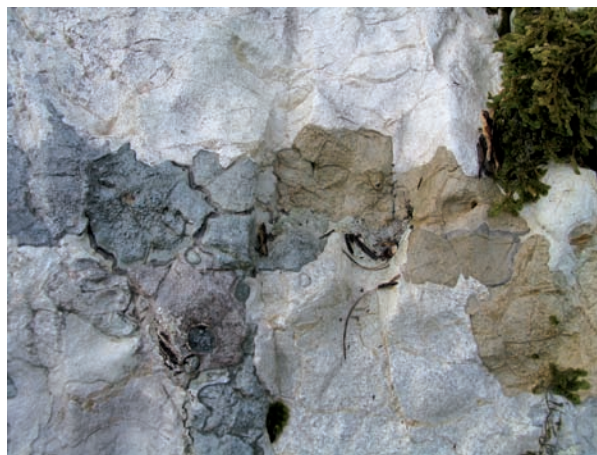
Fig. 3: Bio-corrosively etched surface of karren.

The major part of the forest-covered surface was dissected mainly by individual rocks of various sizes with partially similar traces of formation to the karren described above. They are frequently defined by fun-