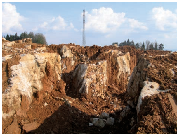
Fig. 6: Wider stone pillars.