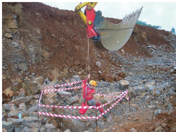
Fig. 8: Discovering of shaft.