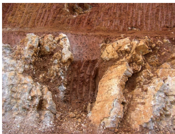
Fig. 11: Subsoil shaft along fault.

Subsoil shafts are more or less vertical hollows, similar to ordinary shafts, through which water also percolates from the karst surface, but they are almost entirely filled with sediment, with only individual vertical sections