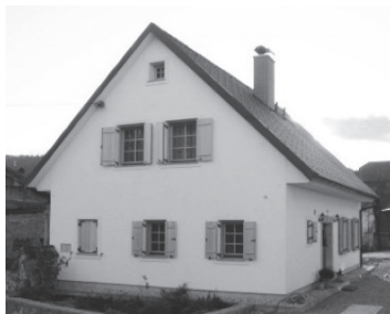
Picture 3: Intervention in architectural heritage (Deu, 2004, 2009).