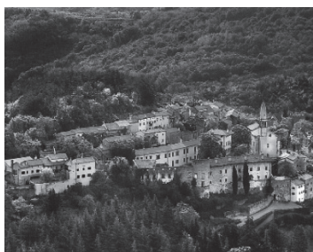
Picture 4: Preservation of architecture in the Slovenian countryside, which is protected as a cultural monument (Deu, 2004, 2009).