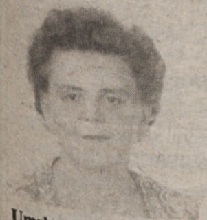
Umrla 3. oktobra 1975.