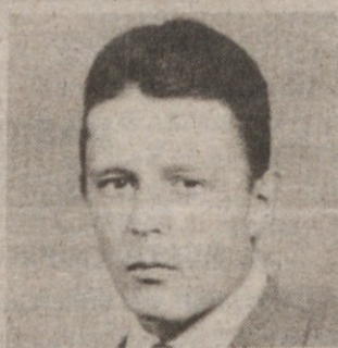
Umrl 30. maja 1945.

Spominjamo se srečnih dni, ko med nami ste živeli vsi, sedaj vse prazno je pri nas, vaš se več ne sliši glas.