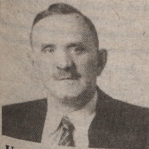
Umrl 7. septembra 1963.