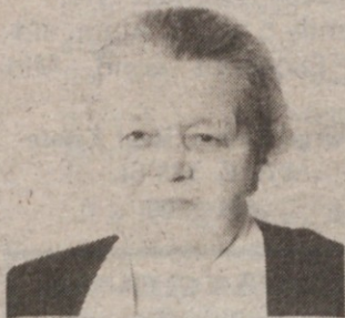
Umrla 8. maja 1972.