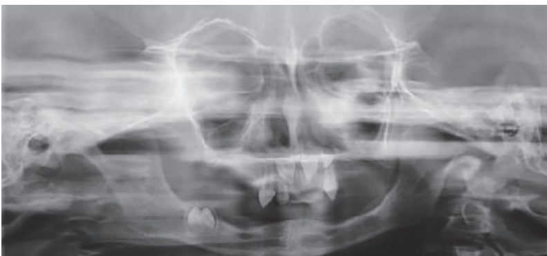
Figure 2: Orthopantomogram of the patient with persistent teeth in the maxilla and one tooth in the mandible.

serious atrophy of the alveolar ridges and severe oligodontia. In the deciduous dentition only the central maxillary incisor and both maxillary canines were identified. These teeth were conically shaped. A basic panoramic radiograph exposed five germs of both maxillary central incisors, the upper left canine and the first right mandibular molar (Figure 2). The crowns of the permanent teeth were malformed with not definitively evolved roots.