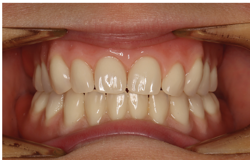
Figure 4: Intraoral appearance of the patient with upper and lower overdentures. Every four months the dentures were corrected according to skeletal growth changes and allowed eruption of the teeth.

The prosthodontic procedures started three weeks later, as soon as the soft tissue around the healing abutments had healed. In the upper jaw, a conventional tooth overdenture with covered two permanent incisors and two deciduous canines was planned. The impression for the upper overdenture was made of Isofunction thermoplastic material