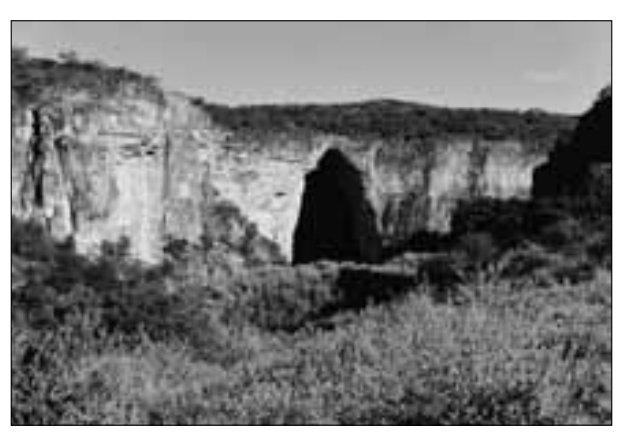
Fig 3: The entrance to the Lapa dos Brejões Cave.