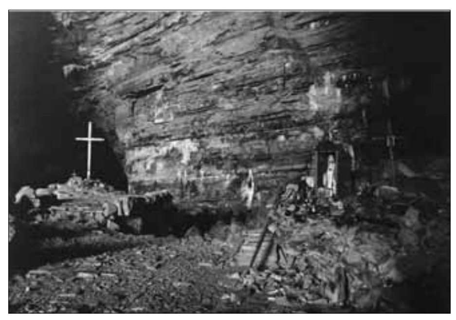
Fig 5: Religious objects inside the Lapa dos Brejões Cave.

The mythical sense of the cave is present at all times and this feature starts with its location. The cave is on the top of a 50 meter-high hill, and the access to it is an irregular and steep path that adds to the pilgrims' suffering. This sacrifice is understood as a way to pay for the sins committed on a daily basis and become purified.