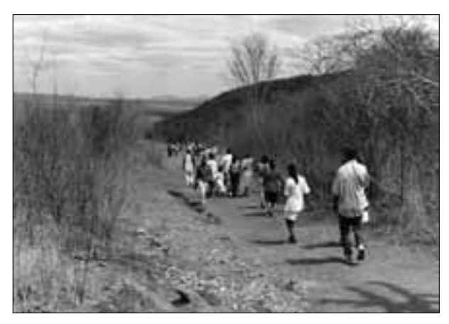
Fig 4: Pilgrims during their journey to the Patamuté Cave.

In other words, the cave became a place that could free them from the suffering caused by the constant droughts or at least minimize it. Steil (1998, 36) calls attention to this phenomenon. Chapels located in wild areas and harsh environment become privileged places for religious pilgrimage and welcome travelers, the sick or adventurers who cross fields and semi-deserts, a context that empowers the recognition of these spaces as sacred spaces (Fig. 4).