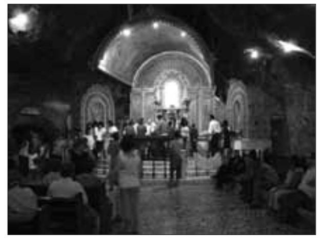
Fig. 2: The main altar of Bom Jesus da Lapa Sanctuary (photo: E.P. Barbosa).

According to Sampaio (2002, 137-138), when a visitor enters the cave, the person experiences its extraordinary and exciting atmosphere. The spectator soon enters the darkness seeing the image of the crucified Bom Jesus da Lapa, offering consolation and cure for those who believe and those who have faith. The pilgrim also experiences emotions and look for the miraculous water that slowly drops from de walls and ceilings. Even non-Catholics cannot deny the effect of excitement when one arrives at the Sanctuary of Bom Jesus da Lapa.