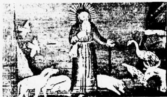
Sv. Anton Puščavnik

Odšli smo torej brez vodnika v Bohinj, čeprav smo ga prav za to pot vzeli. Na Konjski