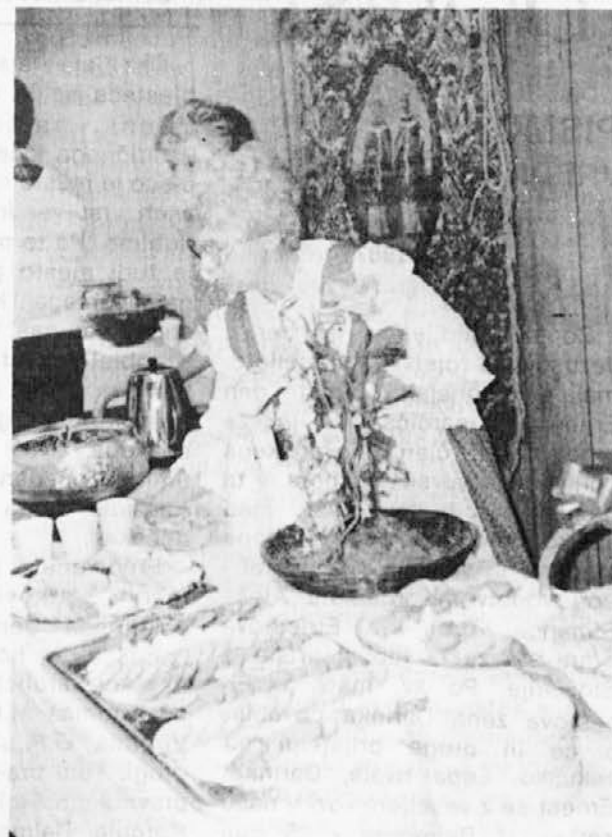
OKUSNO OBLOŽENA MIZA V JOLIETU NA KONVENCIJI