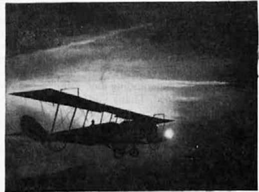
"The Jenny", Bill's model airplane.