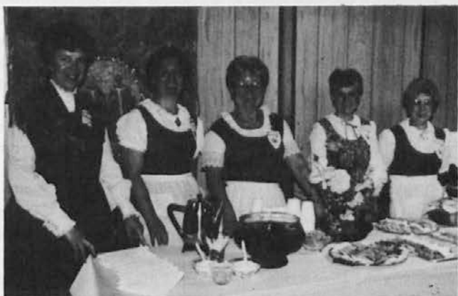
Wonderful members served from beautiful tables and with warm smiles of welcome.