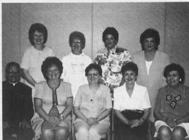
Officers of Branch 20, Joliet