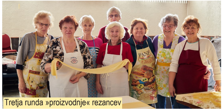
Tretja runda »proizvodnje« rezancev

We look forward to seeing you at the bazaar!!