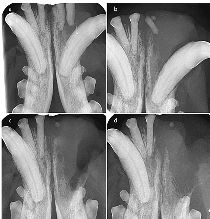
Figure 2: (A) Dental radiograph, occlusal view of the rostral mandibles at initial presentation. Geographic bone loss at the left mandibular incisor and canine teeth was visible on dental radiographs, and permeative pattern of bone loss in the symphyseal region suggested bony involvement of both rostral mandibles (T3b). Clinical assessment of radiographically abnormal (fractures or abrasion) left mandibular incisor teeth was impossible as they were embedded in the tumor mass. Right mandibular third incisor tooth is missing. (B) Dental radiograph, occlusal view of the rostral mandibles at 4 weeks. Radiographically visible severe progression of the osteolysis. Left mandibular second and third incisor teeth had exfoliated since the last visit. There is a total loss of attachment at the left mandibular first incisor tooth and near total loss of attachment at the left mandibular canine tooth, therefore these two teeth were removed (C). The round poorly mineralized structure remained, as it was hidden in the soft tissues of the tumor. (D) Dental radiograph, occlusal view of the rostral mandibles at 10 weeks. Radiographically subjectively decreased osteolysis progression

After discussing possible treatment options, including bilateral rostral mandibulectomy in combination with radiotherapy, the client elected ECT and EGT. During the next four months, four therapy sessions were performed (Graph 1). Each session was performed with the dog under short (approximately 30 min) general anesthesia, starting with ECT using intravenous application of bleomycin (Blenoxane, Bristol-Myers, Princeton, USA; 3 mg/ml) at the dose 0.3 mg/kg, followed by delivery of electric pulses with electric pulses generator Cliniporator™ (IGEA s.r.l., Carpi, Italy). Train of 8 pulses was applied, each pulse of 100 \mu s duration and amplitude to electric distance ratio of 1300 V/cm and frequency of repetition 1 Hz, using two parallel stainless steel plate electrodes with 6 mm distance between them. This procedure was followed