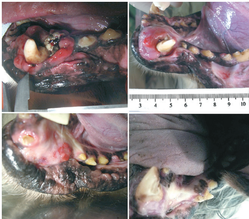
Figure 1: The figure is showing regression of the tumor mass at different time points. (A) tumor mass at the time of the first therapy. (B) clinical regression of the tumor at 4 weeks after the first therapy and before the second therapy. (C) four months after the first of the tumor therapy the size of the tumor significantly decreased. (D) seven months after initial therapy complete regression could be seen

A 15-year-old male castrated English setter, weighing 22 kg, was presented to the Small animal clinic of Veterinary faculty Ljubljana for evaluation of a rapidly growing oral mass. History of the patient was unremarkable, except persistent moderate proteinuria of 5 years duration, which has been well controlled with appropriate diet and enalapril. Clinical examination findings were within normal limits, apart the large mass at the left mandibular canine tooth. The client declined full staging including head CT scan and diagnostic imaging for possible distant metastases. Therefore only partial staging was performed, including complete blood count with white blood cell count (performed using an automated laser hematology analyzer with species-specific software Advia 120, Siemens, Munich, Germany) and detailed biochemistry panel (performed using automated chemistry analyzer RX-Daytona, Randox, Crumlin, UK). Biochemistry panel consisted of serum concentrations of glucose, urea, creatinine, Na, K, Cl, Ca, total proteins, albumin and serum activity of alkaline phosphatase, alanine aminotransferase and creatine kinase. All parameters were within normal limits except moderate, clinically