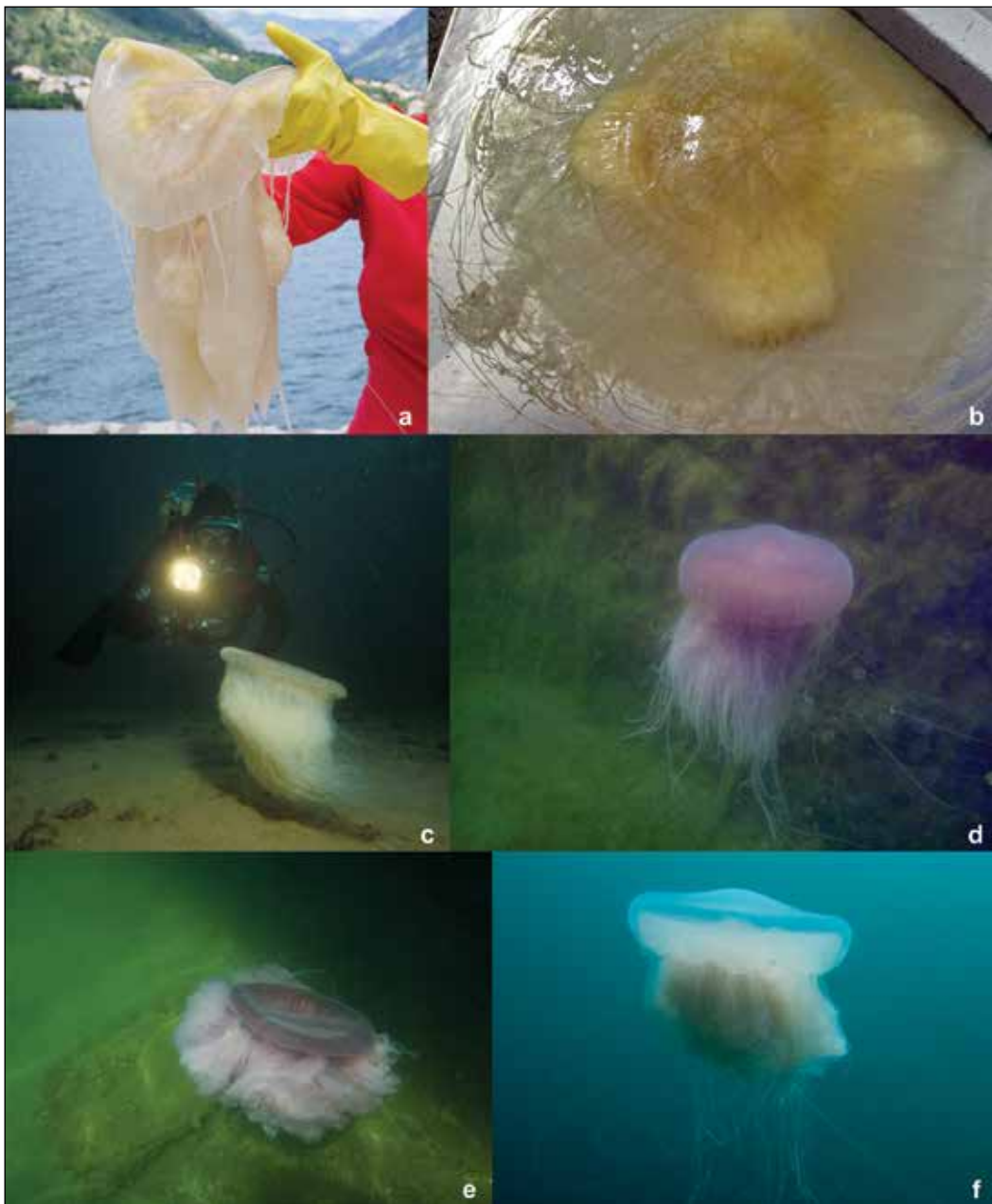
Fig. 2a: D. dalmatinum collected on 2 June 2014 in Boka Kotorska, bell diameter 35 cm.

Sl. 2a: Dalmatinska lasasta meduza, ulovljena 2. 6. 2014 v Boki Kotorski, premer klobuka 35 cm