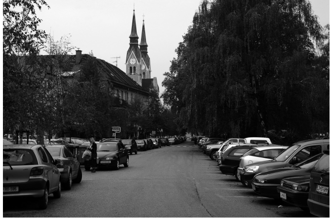
Figure 8: Trnovo's mixed landscape.

otherwise appears to be a simple story of neighborhood destruction by outside forces of modernization. In the official gaze of 1960s urban planners, Trnovo held almost nothing modern, a shortcoming that needed to be professionally corrected. To the sensibilities of successful, prominent, and well-educated individuals in socialist society, Trnovo held very little of the modern – and this precisely was what made it significant for Ljubljana, within Slovenia. However, in the eyes of the Trnovo residents whose families had engaged in commercial gardening for several generations, they and Trnovo had always been part of the modern. The landscape that resulted from the implementation of the 1960s plans mirrors these disparate notions of modernity: old farmhouses, high-rises, and a vast and startling socialist suburbia sit next to one another, but do not mingle.