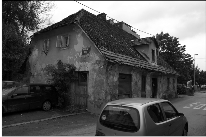
Figure 4: Trnovo historic housing.

In listing the positive aspects of the neighborhood, the 1970 Program Section of the Construction Plan underscores the potentially modernizable characteristics of the area as its best assets – these being its location and potential to accommodate (new) high-quality housing. These features were all to be incorporated into the new plan, which was to emphasize “modern” living in high-rise apartments and extensive individual housing. Thus, the declared criteria determining favorability in housing was newness, or modernist-ness, couched in questions of quality of life. Undeclared in this vision of the modern neighborhood was the clear consequence of this plan: all the historic housing and adjoining gardens, associated with “folksy” Trnovo since at least the 1933 popular ethnographic study, would be physically erased.