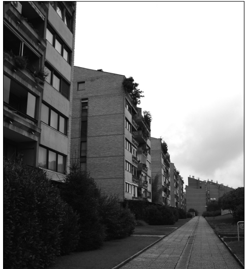
Figure 2: Trnovo high-rises.