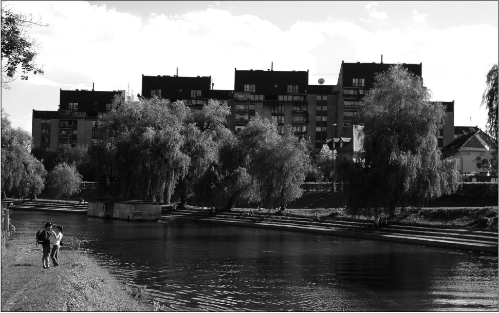
Figure 5: Jože Plečnik's Ljubljana River riverfronts.

of the narratives on Trnovo frequently expressed by the socially prominent. Interestingly, in 2001–2002 he was recommended by everyone as the living authority on Trnovo – although he only lived there as a child and is from a local gardening family of “old Trnovo residents.” Hudeček remembers Trnovo as a refuge from the Second World War, and his descriptions of this neighborhood have a romantic tone that is reminiscent of early 20th-century ethnology: