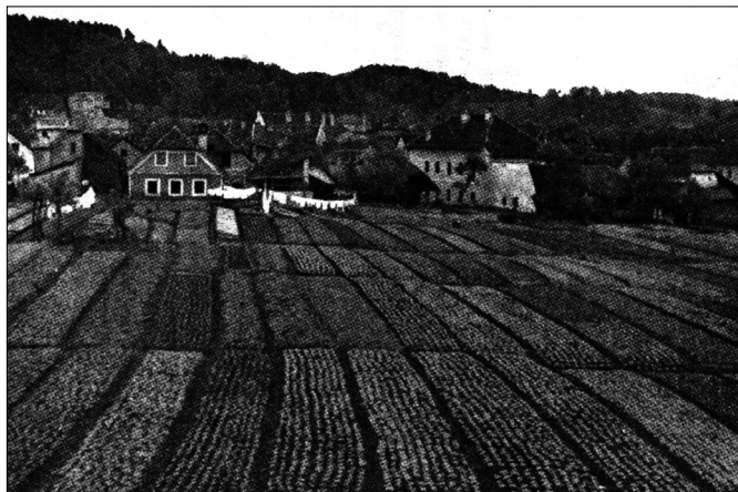
Figure 1: Historic Krakovo gardens [Vrhovnik 1933].

Trnovo developed into a commercially vibrant extension of Ljubljana that provided key services to the town, including commercial gardening. Although Trnovo was incorporated into greater Ljubljana in the mid-1800s, it retained its outlying-village atmosphere, even after internationally acclaimed Slovenian architect Jože Plečnik designed riverfronts and bridges for the neighborhood in the 1930s.