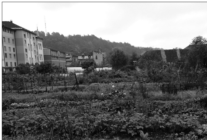
Figure 6: Krakovo gardens.

velopment, however, Hudeček concedes the need for the modernization of historic Trnovo, noting ... those earlier, single-story, little houses which had, say, uninsulated foundations, where people lived out their days in an unhealthy environment – it was damp, for example. Hudeček, however, has no love lost for the new settlement that replaced the neighborhood of his childhood. When speaking of Trnovo, he frequently notes the suicides and disorientation that followed the displacement of – for him – its special population, in an indirect critique of the “necessity” of this development: