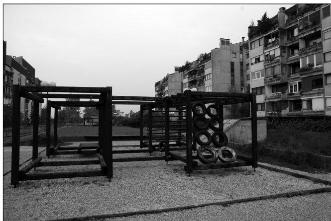
Figure 3: Trnovo high-rises.

the 1966 Generalni urbanistični plan Ljubljane (General Urban Plan for Ljubljana), deals with historic preservation issues by detailing an intricate plan of monuments to the People's Revolution ( Ljudska revolucija ) [LUZ 1966].