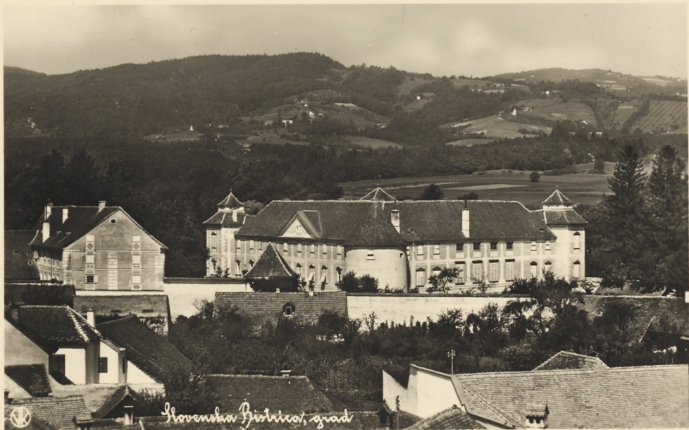
Hovenska Bistrica, grad