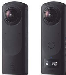
Figure 1: Full Spherical Camera model RICOH THETA Z1

The Full Spherical Camera model RICOH THETA Z1 presented in Figure 1 was used for shooting Virtual Tours.