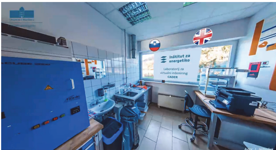
Figure 4: Snapshot from the Virtual Tour

With the help of the Virtual Tour of the laboratories, a virtual conference with a virtual walkthrough of the laboratories was performed with great success. The moderator was able to present all the rooms, and the Professors could describe the equipment available and the field of work of every laboratory.