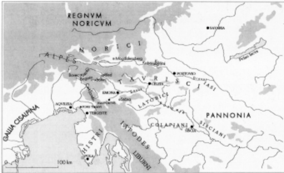
Fig. 1: Sites, rivers, mountains, and peoples mentioned in the text. Kraji, reke, gore in plemena, ki so omenjeni v besedilu.

of a much earlier date, the Taurisci were in general openly hostile to the Roman state. 5 G. Alföldy, who rejected any connection between the gold mine affair and Tuditanus' expedition, located the gold mine in the Norican kingdom. 6 First of all, the location of the mine must once more be briefly examined.