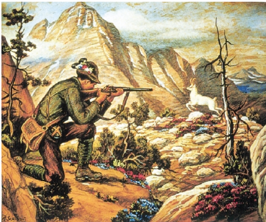
Fig. 2: A picture of the Goldenhorn-Zlatorog (by Maksim Gaspari). Gasparijeva slika Zlatoroga.

from the drops of his blood, curing all his wounds. Whoever could seize his golden horns, would gain access to all the hidden treasures guarded by a multi-headed serpent in Bogatin Mt. An Italian gold-digger once succeeded in taking possession of a scrap of Zlatorog's golden horns that Zlatorog had rubbed off on a rock, and with it he could get the hidden gold, which he exploited for the rest of his life.