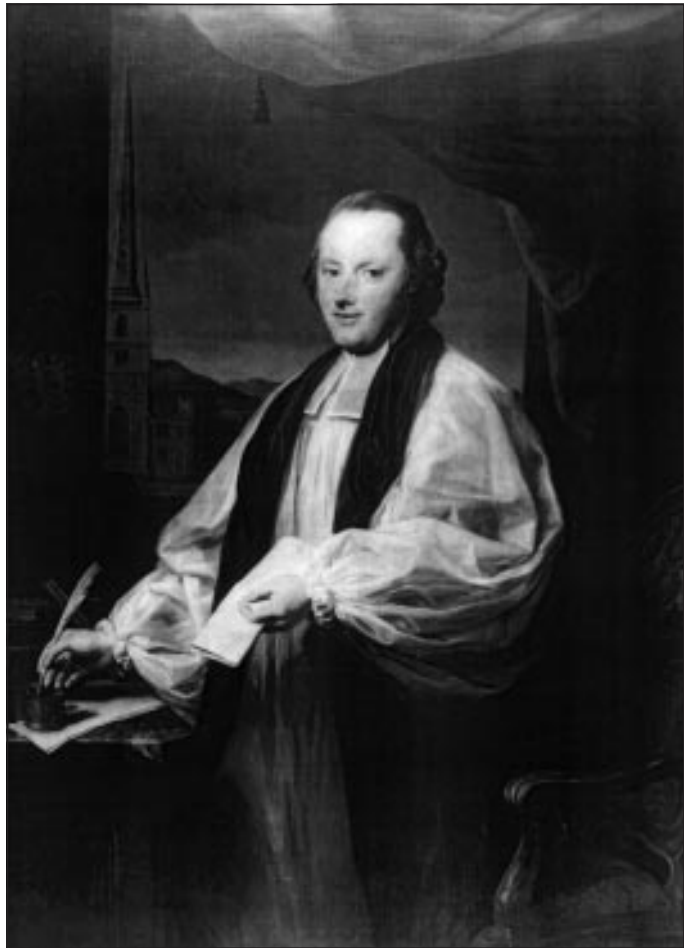
Fig. 1: Frederick Hervey in 1777 or 1778, painted in Rome by Pompeo Batoni.

Having been educated at Corpus Christi College, Cambridge, he trained first as a lawyer and then became a priest.