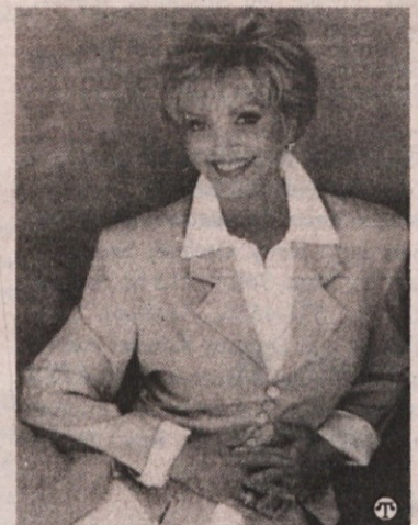
TV personality Florence Henderson has taken a leadership role in educating women about key health issues.

"My mission is to encourage women to act now to protect their bones—the foundation to their