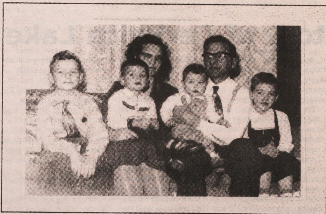
Our family on Christmas Day, 1955.