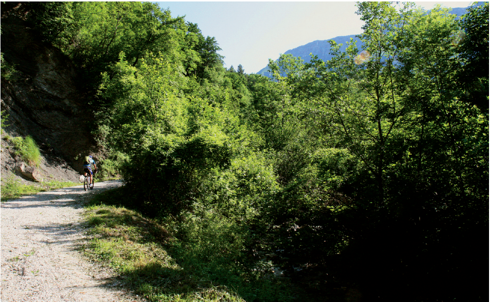
Fig. 4: The path along Ročica stream leading up to Sapota Waterfall, a few dozen meters below where N. apatelios specimens were collected. Mt. Krn can be seen in the background.