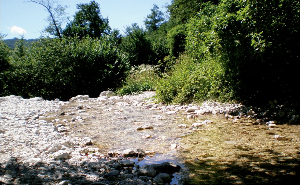
Fig. 3: Ročica stream, near the collection site.