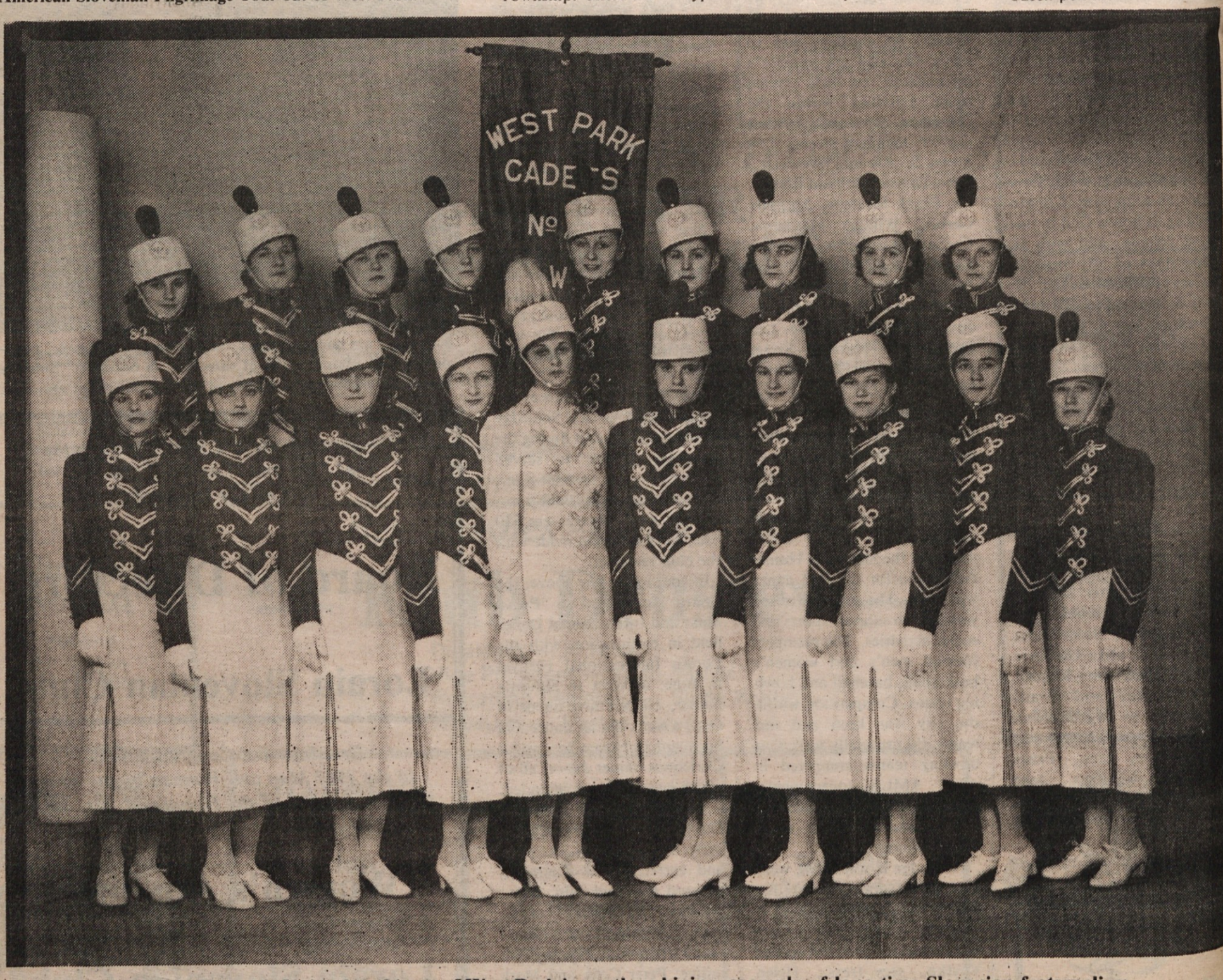
Slovenian Women's Union No. 21 out of West Park is another shining example of long-time Slovenian fraternalism.