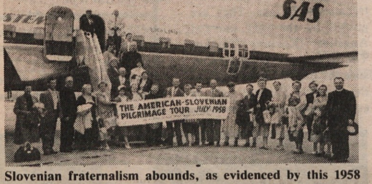
Slovenian fraternalism abounds, as evidenced by this 1958 American-Slovenian Pilgrimage Tour out of West Park.

In our area we no longer seek out Slovenians. Sure, they are around if you can hunt them out of Parma, Berea, Elyria and towns circling. Since we are so integrated, third and fourth generations, ethnicity is homogeneous. We may have strong ties in one or another culture. The media gives us all a taste of each. We we do the Polish hop to Slovene, Polish, Czech polkas!