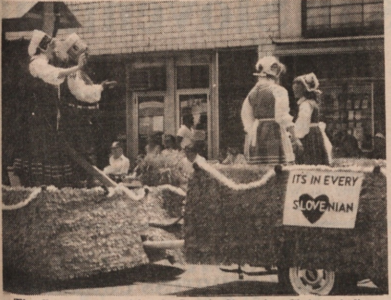
The float sponsored by the Lorain Slovenian Club took first place in last summer's Lorain International Parade.