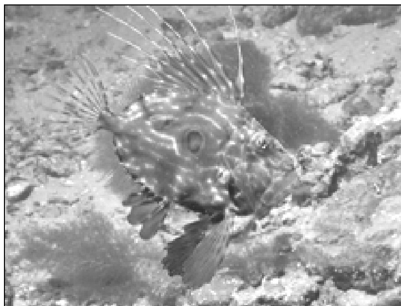
Fig. 3: John Dory ( Zeus faber ) (Photo: T. Makovec).

Sl. 3: Kovač ( Zeus faber ) (Foto: T. Makovec).