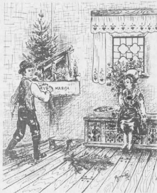
"God's Corner" – BOGOV KOT –