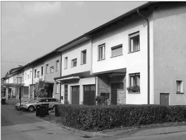
Figure 4: Persons with a higher level of positive and stable self-esteem (i.e., internal self-esteem) have more positive and clear expectations with regard to purchasing real estate.

about the setting of the hypothetical model of psychological factors in the decision to buy real estate, which integrally and relationally clarifies the role of psychological characteristics of real estate buyers in their expectations regarding the decision to buy. In our model, these are basic and status motives, subjective emotional wellbeing and self-esteem.