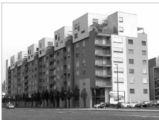
Figure 3: People with a higher level of satisfied needs are more satisfied with their real estate or have clearer and more positive expectations with regard to their purchase.

of the two groups of factors in the decision to buy real estate, the real estate itself and the psychological factors.