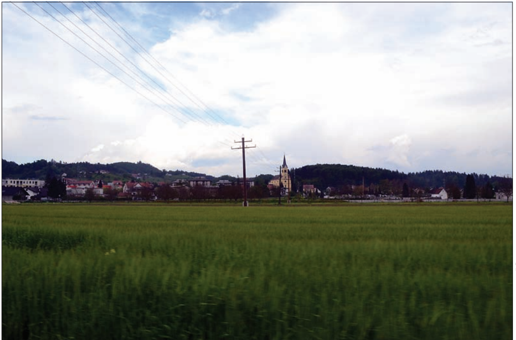
Figure 3: Example of highly rated photograph taken in a coldspot.