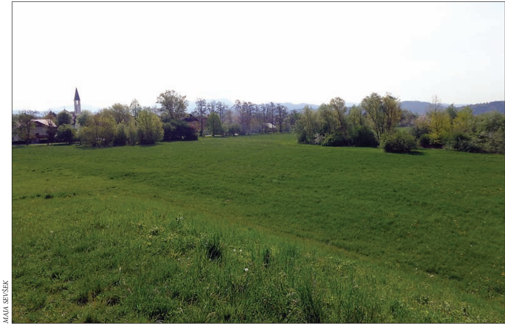
Figure 5: Example of poorly rated photograph taken in a coldspot.