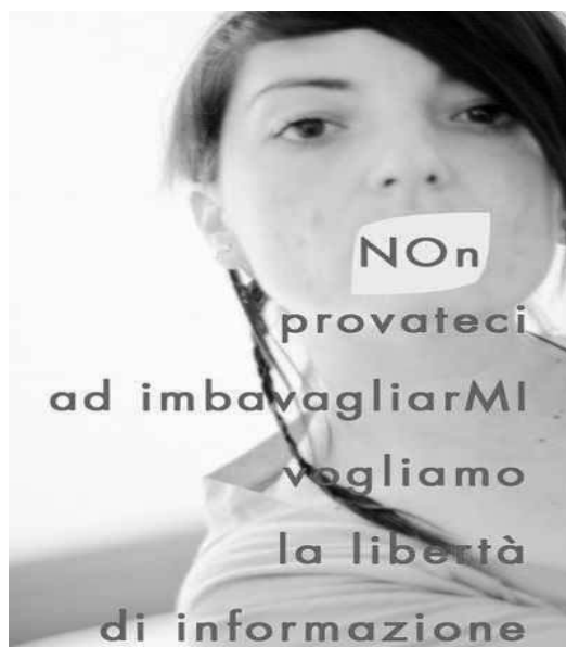
Figure 2: The Poster Displayed at the Libera Informazione Events

from the Libera Informazione , the persuasion impact of emotions should be realised publicly not only by illustrating emotions of the criminals but also the victims.