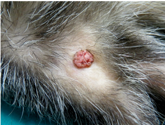
FIGURE 1. Macroscopic presentation of squamous papilloma (Tumour 4).

body. They are firm, warty and often multinodular, sometimes looking very similar to MCTs. They can be ulcerated, irritated and traumatised with local inflammation. 2,4