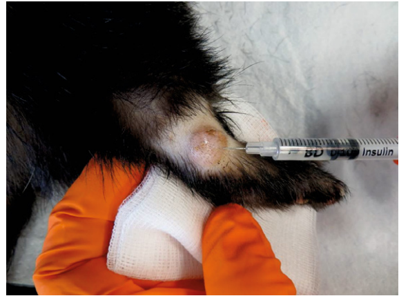
FIGURE 4. Intralesional injection of bleomycin into mast cell tumour (Tumour 2) located laterally on the right hock. Note the size of tumor and surgically challenging anatomical location.

In the first patient, both masses were diagnosed as MCTs, and in the second patient, squamous papilloma of hock region and sebaceous adenoma of chest region were diagnosed. Haematology,