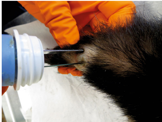
FIGURE 6. Electric pulses were delivered to the mast cell tumour (Tumour 2) using plate electrodes.

electrodes (distance between the electrodes: 6 mm) (Figures 6,7). Good contact between the electrodes and tumour mass was obtained by application of conductive gel to the treatment area. Electric pulses were generated by the electric pulse generator (Cliniporator™ - IGEA srl, Carpi [MO], Italy). The entire tumour was exposed to electric pulses by moving the electrodes perpendicular through the whole volume of mass and the surrounding skin, starting on the tumour periphery. The duration of each ECT cycle was approximately 15 minutes, and in both cases, the recovery from anaesthesia was uneventful. Meloxicam (Loxicom; Norbrook Laboratories) in a dose 0.2 mg/kg/day 9 was prescribed for 3 consecutive days orally after every cycle of ECT to reduce pain and inflammation.