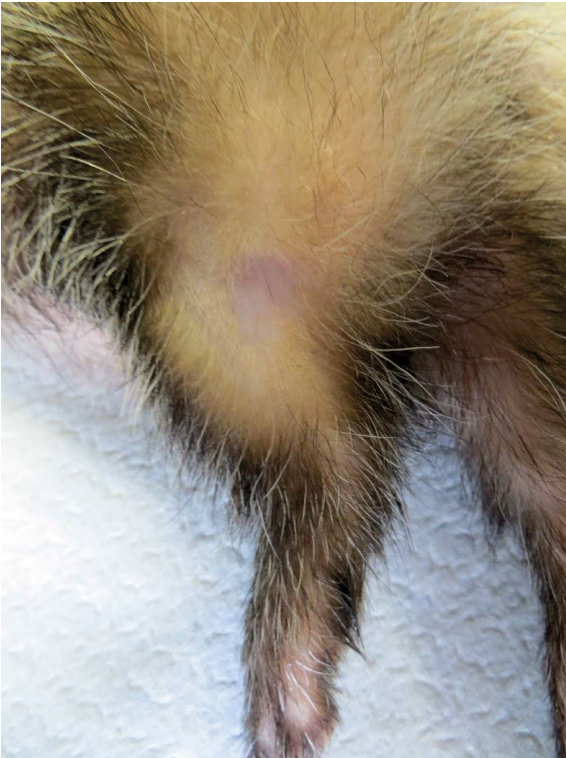
FIGURE 10. Complete response of squamous papilloma (Tumour 4) - 70 days after electrochemotherapy.

ti-tumour effectiveness, combined with excellent functional and cosmetic effects, while being less invasive than surgery. 8,10,11,12