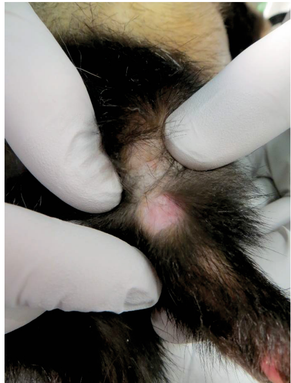
FIGURE 9. Complete response of mast cell tumour (Tumour 2) - 67 days after electrochemotherapy.

ECT with bleomycin as a single treatment was an effective treatment of cutaneous neoplasms; MCTs, sebaceous adenoma, and squamous papilloma in our cases. ECT was well tolerated by the patients and is a minimally invasive procedure with no major side effects noted, with excellent responses and long-lasting CR. In first patient, no tumour growth was seen during observation period of 15 months after ECT of the tumour located on the tail base, and 11 months after ECT of the tumour located on the right hock. In second patient, no tumour regrowth was seen 8 months after treatment. Different studies reported an excellent treatment response of ECT with cisplatin or bleomycin in tumours of different histology with minimal side effects in dogs 10,11 , cats 12 , horses 13 , pet rats 14 , and reptiles 15,16 . In our cases, only some muscle contractions of the