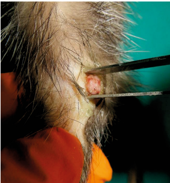
FIGURE 7. Electric pulses were delivered to the squamous papilloma (Tumour 4) using plate electrodes.