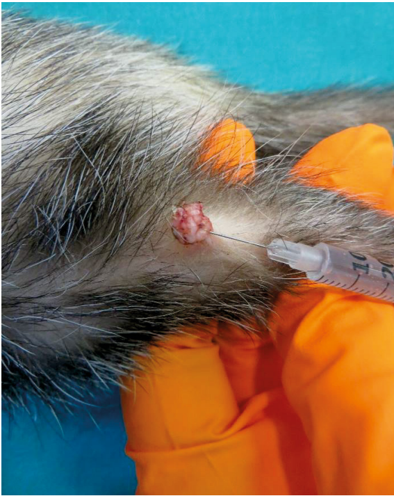
FIGURE 5. Intralesional injection of bleomycin into squamous papilloma (Tumour 4).