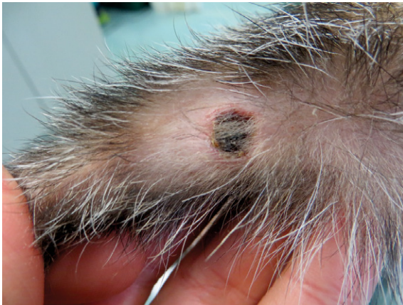
FIGURE 8. Necrosis with superficial scab of squamous papilloma (Tumour 4) 8 days after electrochemotherapy.

the MCT located on the laterodorsal tail base became necrotic on day 6 and a complete response (CR) was seen approximately 1 month after ECT, while the second MCT found on the lateral side of the right hock became necrotic on day 15 and CR was seen approximately two months (67 days) after ECT (Figure 9). In second patient, both tumours became necrotic on day 8 (Figure 8) and CRs were seen 70 days after ECT (Figure 10). In first patient, no tumour growth has been seen during the observation period of 15 months after ECT of the tumour located on the tail base, and 11 months after ECT of the tumour located on the right hock. In second patient, no tumour recurrence was detected 8 months after treatment.