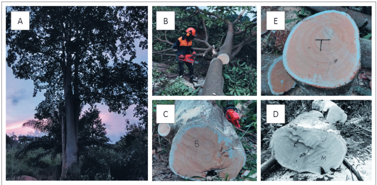
Figure 1. Alstonia boonei : living tree (A), harvested (B) and processed into base (C), middle (D) and top portions (E).

Slika 1. Alstonia boonei : rastoče drevo (A), posek drevesa (B) in krojenje debla na spodnji (C), srednji (D) in zgornji del (E).