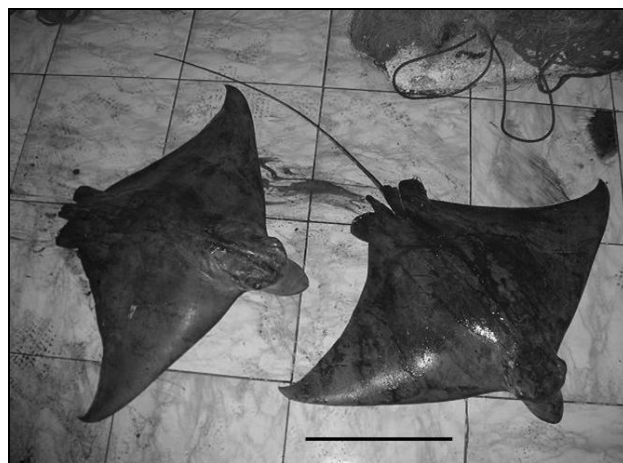
Fig. 2: Both specimens of P. bovinus captured in the Lagoon of Bizerte, scale bar = 500 mm.

Sl. 2: Primerka P. bovinus , ujeta v Laguni Bizerte, merilo = 500 mm.